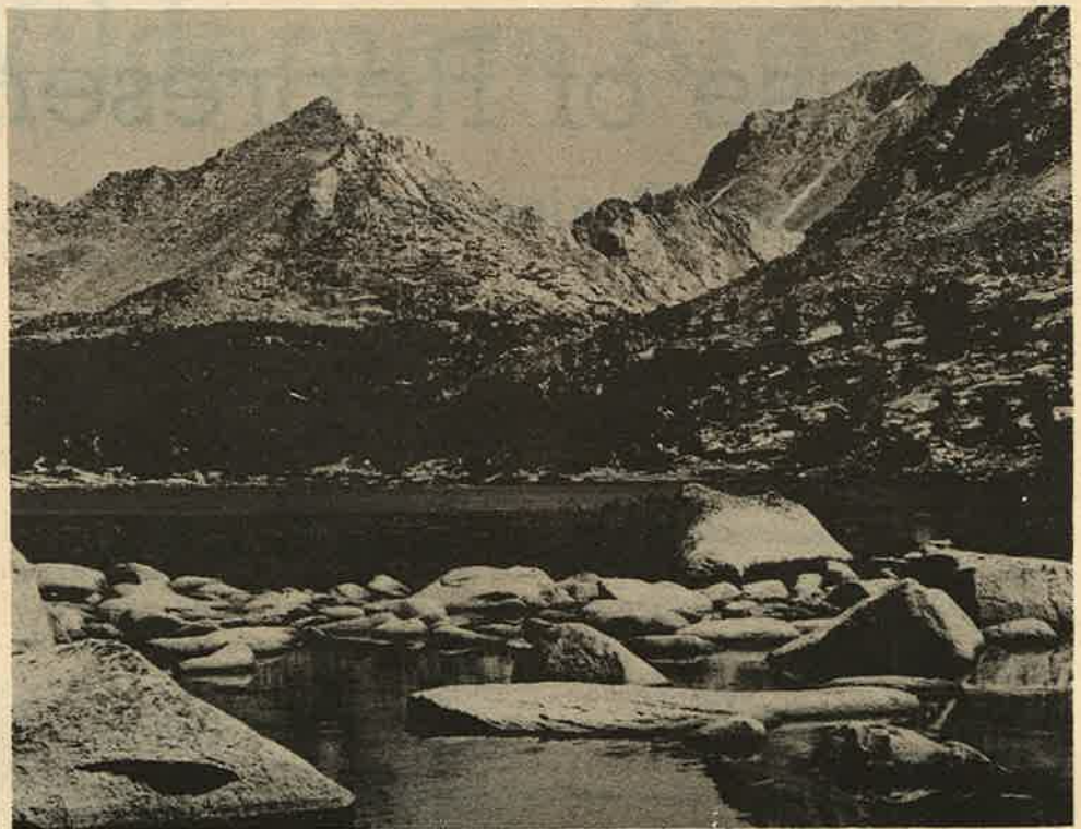
Bullfrog Lake, Sequoia-Kings Canyon Wilderness

A sizable BLM wilderness study area is adjacent to the eastern boundary of this wilderness.