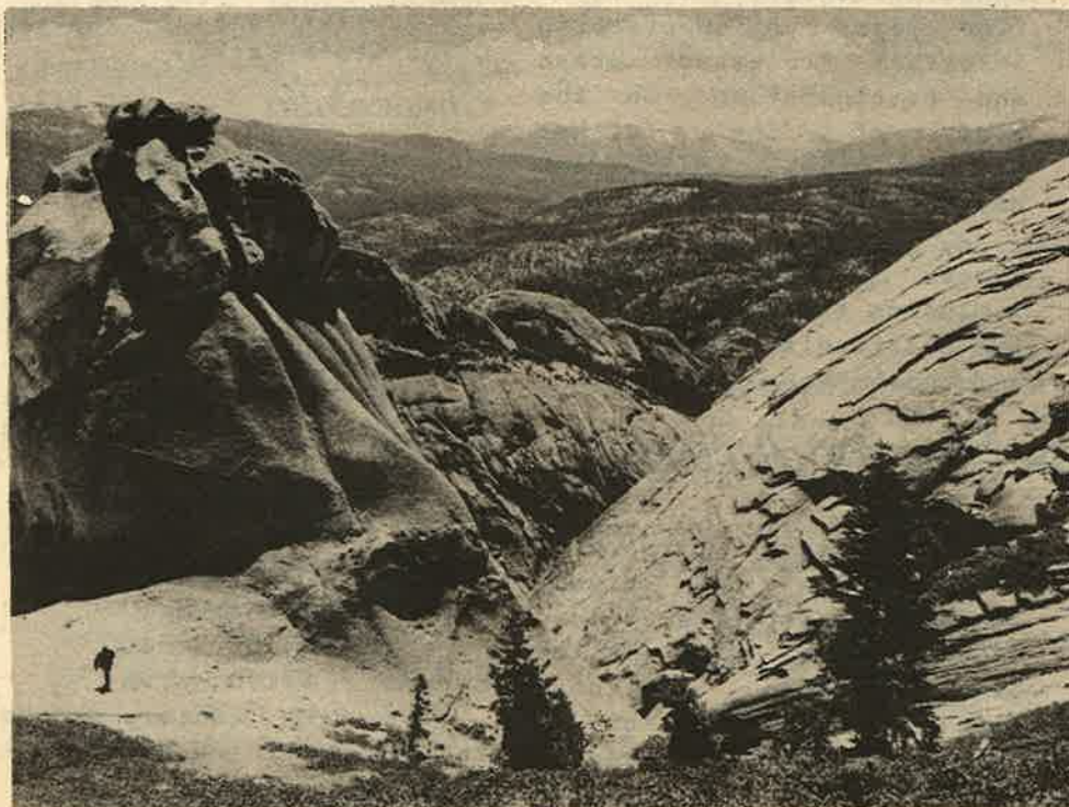
Ansel Adams (San Joaquin) Wilderness