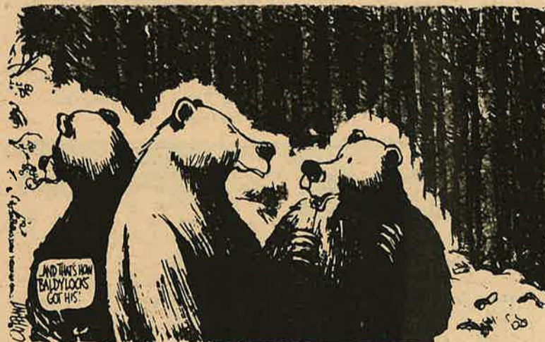
"Surely," says I. "Not THE James Watt, folk-hero and famous wilderness rapist!" "That's me," says he. And I says, "Not the renowned despoiler of our precious national heritage!" "Right," says he. "So I ate him."