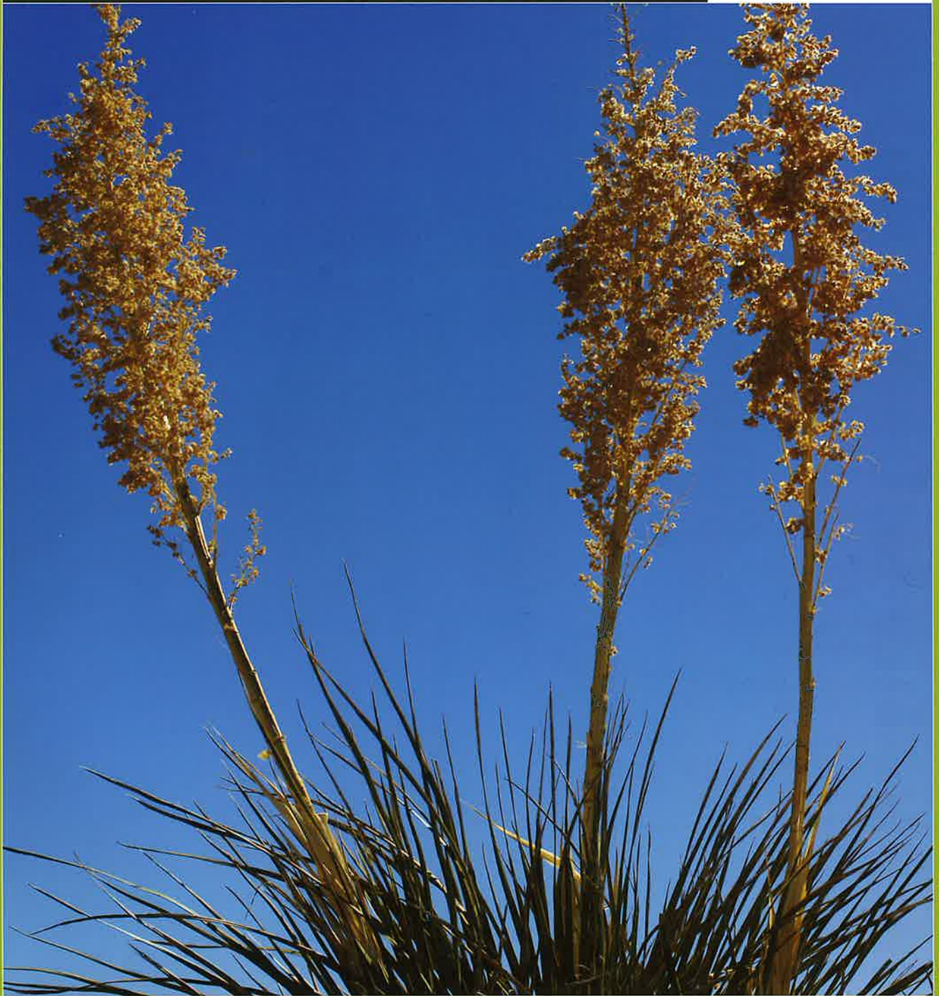
Yucca whipplei bloom in Joshua Tree National Park