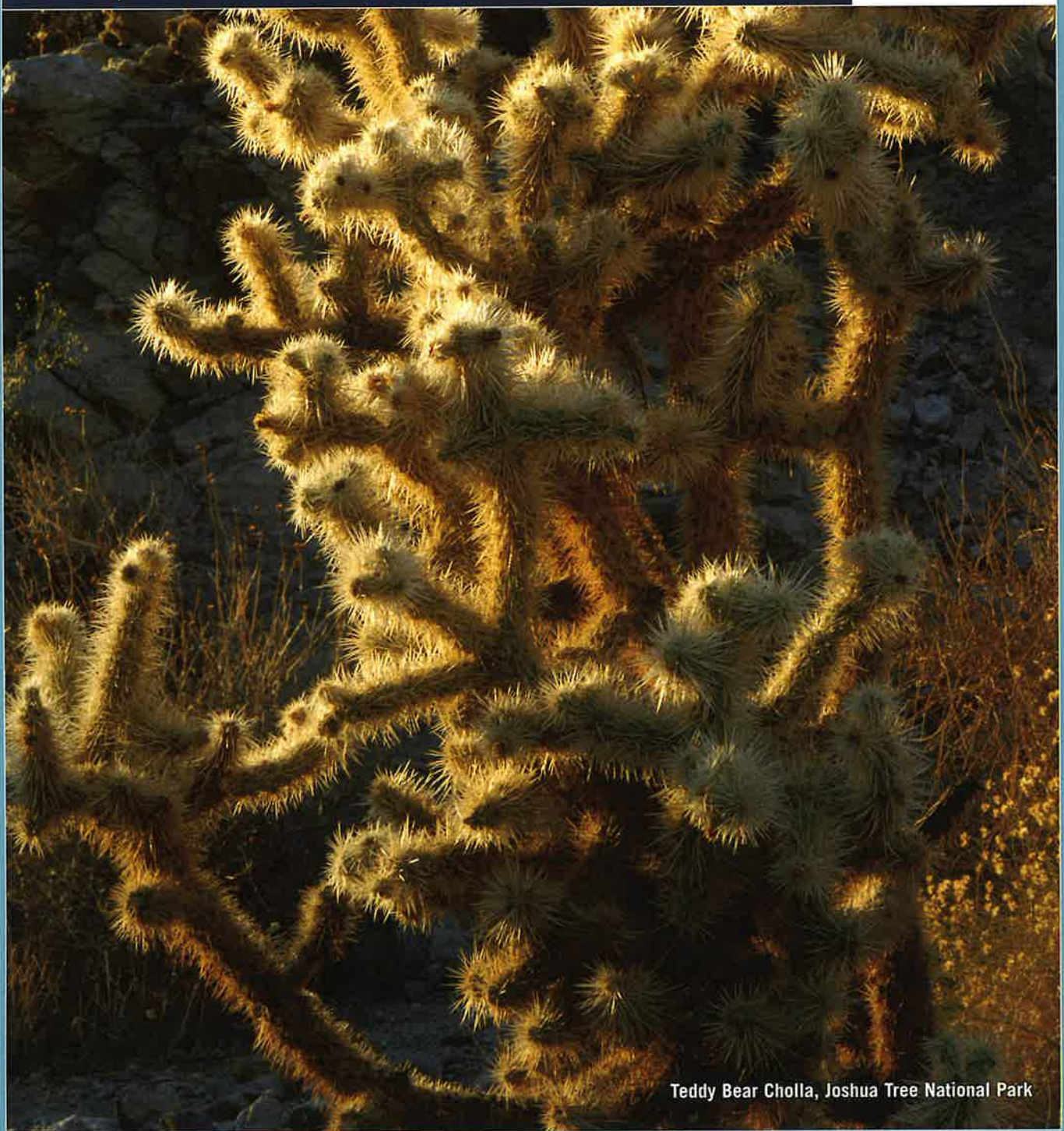
Teddy Bear Cholla, Joshua Tree National Park

California Desert and Mountain Heritage Act Reaches Important Milestone page 6