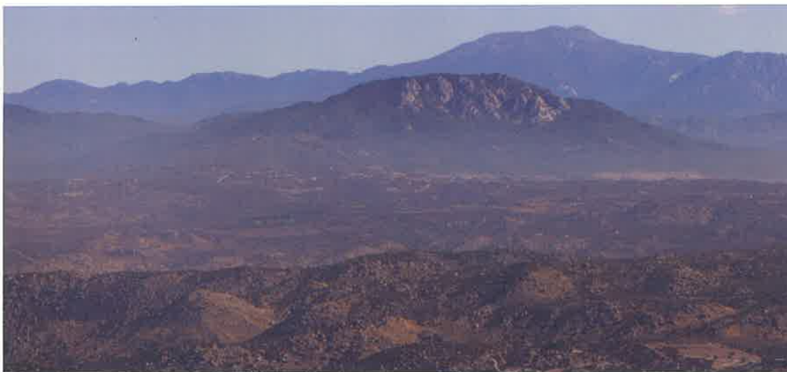
The Cahuilla Mountain proposed wilderness offers visitors outstanding views of the Cahuilla and Anza Valleys and the San Jacinto Wilderness to the northeast