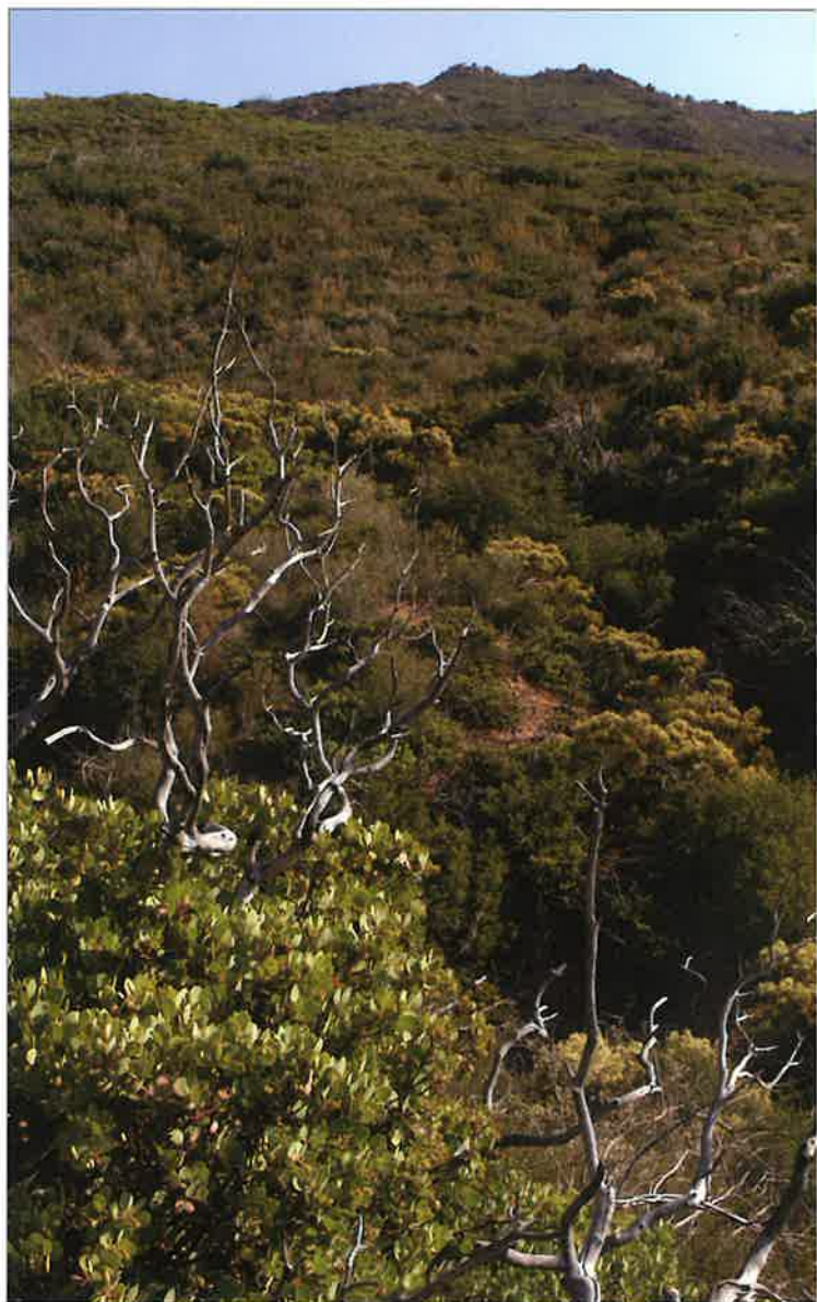
(ABOVE) The Cahuilla Mountain proposed wilderness is one of the many beautiful areas included in the California Desert and Mountain Heritage Act

After six successful years, the California Wild Heritage Campaign, comprised of CWC, Friends of the River, Sierra Club, The Wilderness Society, and our regional partners, are looking south and east for new wilderness opportunities. The California desert and the east side of the Sierra Nevada have the most promising political outlook in the 110th Congress for wilderness designation. Some of the areas have been in wilderness legislation in the past, while other lands present new opportunities due to recent acquisitions.