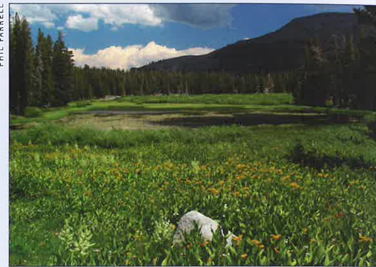
Meiss Meadows Proposed Wilderness, Eldorado and Humboldt-Toiyabe National Forests

routes in California's national forests. Conservationists have a once-in-a generation opportunity to protect wild places by keeping motorized routes out of potential wilderness and setting in place a sustainable route system that can be