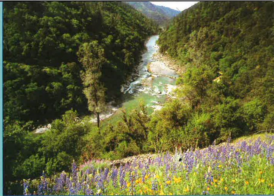
North Fork American Proposed Wilderness