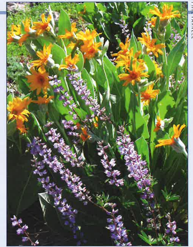
Mule Ears and Lupine, Castle Peak Trail, Castle Peak Proposed Wilderness, Tahoe National Forest

As the route designation process moves forward we are seeing early signs of conservation gains. The Smith River National Recreation Area and Orleans Ranger District recently issued a final decision to decommission hundreds of miles of roads that were fragmenting habitat and increasing sediment loads in local rivers. The Tahoe National Forest is proposing to add only 60 miles of new off-road vehicle routes after their inventory discovered over one thousand miles of unplanned and user-created routes throughout the forest. The California Wilderness Coalition is working with conservationists throughout the state to monitor and improve route designation proposals as they move forward.