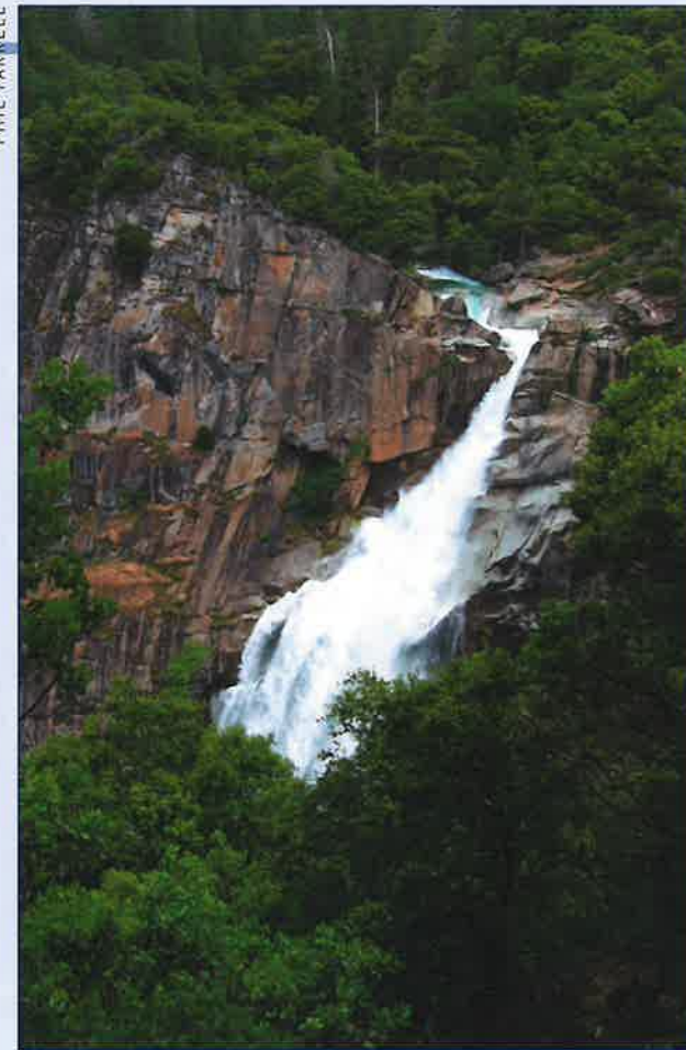
Feather Falls, Feather Falls Proposed Wilderness, Plumas National Forest