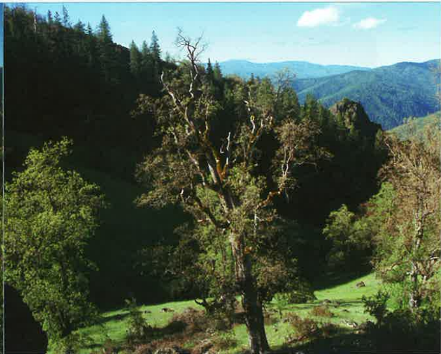
The stunning 50,000 acre Yuki Wilderness will be permanently protected by the Northern California Coastal Wild Heritage Wilderness Act