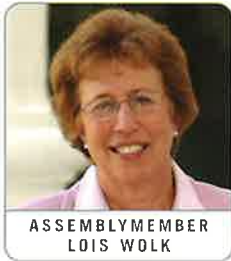
ASSEMBLYMEMBER LOIS WOLK

The stream has long been the target of dam projects and water diversions. Assemblymember