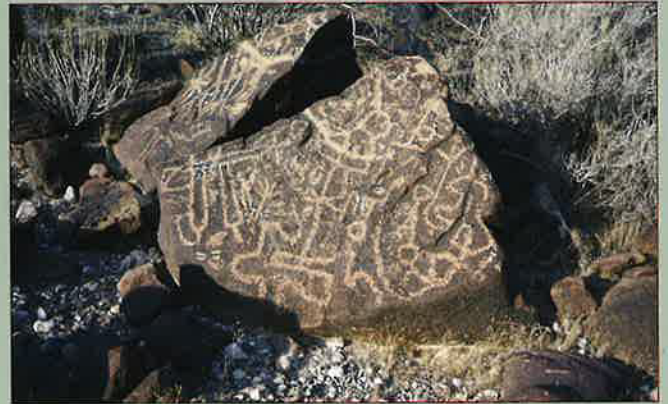
Petroglyphs in the Turtle Mountain Wilderness.

Directions to trailhead: Mopah is accessed via a short dirt road going west from U.S. Route 95. Drive south from Needles about thirty-six miles and look west for a narrow two-track. It's obscure, but shows on both the AAA San Bernardino County map and the topo map for the area. If you pass a point directly west of Pyramid Butte on the east side of the highway, you've gone too far. Drive west in open desert on the two-track directly toward the Mopah Peaks, which show prominently. The Wilderness boundary is about three and a half miles. Cars can be parked alongside when the road becomes rocky. Mopah Wash is an easy walk from there.