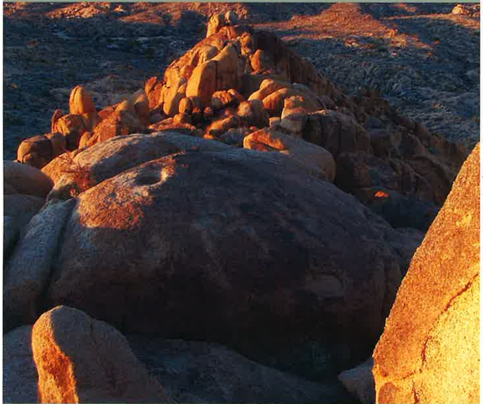
Rock formations in Joshua Tree National Park.

Since 1976, we have empowered local communities and conservationists to be the voice for wild California.