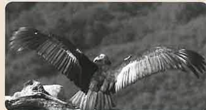
The endangered California condor and San Joaquin kit fox both make their home in the Los Padres National Forest.

The Forest Service did listen to the public in one important respect. The plan prohibits drilling on over 100,000 acres of pristine roadless land in the forest. Unfortunately, the Forest Service has allowed drilling underneath and beside some of the areas using "slant drilling" techniques. While CWC is concerned about those exceptions, the decision not to drill directly on those wild lands allows them to still be considered for permanent protection by Congress. For years, CWC and its partners have been fighting first and foremost to keep any new drilling in the Los Padres out of its roadless areas until they can be protected as wilderness by Congress. Condors, kit foxes, and people will then enjoy the Los Padres forever.