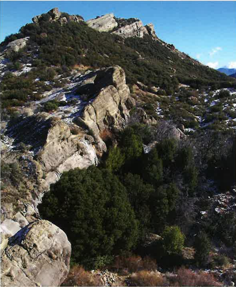
Located in the Los Padres National Forest, the Sespe Wilderness contains many fascinating rock geological formations caused by the dramatic uplifting of sandstone and shale beds.

This summer, despite years of public opposition, the U.S. Forest Service approved a plan to allow drilling on an additional 52,075 acres of public land in the Los Padres National Forest. It's an unfortunate decision for a beautiful landscape already subject to the direct and collateral damage of oil and gas drilling.