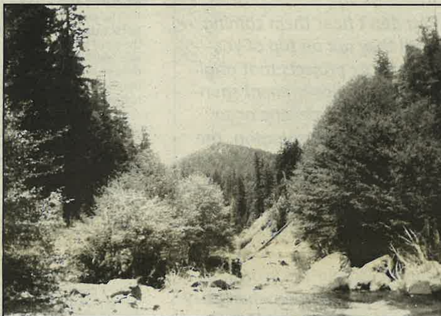
The headwaters of the main stem Eel River. Downstream up to 90 percent of its water is diverted for hydroelectric generation.

Sonoma County Water Agency's own analysis in 1990 (and again in 1994) stating that there is plenty of water in the Russian River system to meet all legitimate existing needs (with the exception of the community of Potter Valley, which has come to rely on the diversion). This is a political water grab, pure and simple. Sonoma County would maintain the Potter Valley Project not as a hydro-