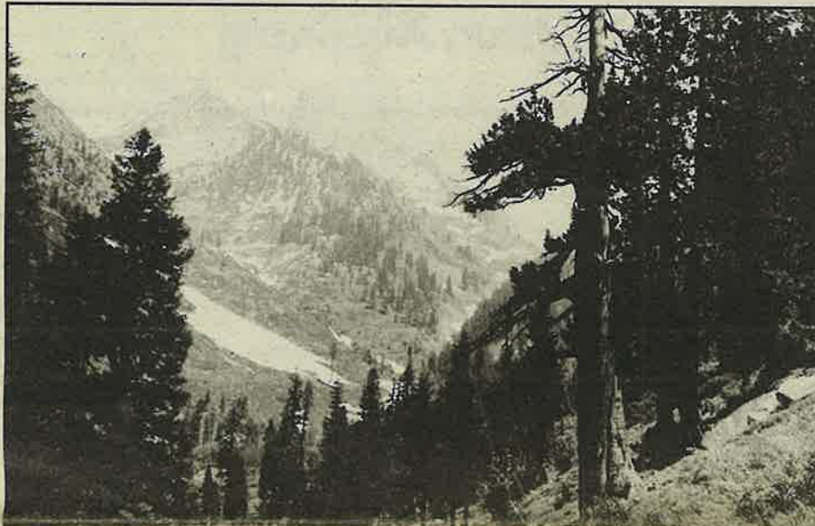
Mineral King, Sequoia National Park, looking toward the Golden Trout Wilderness. The goal of the Sierra Nevada Forest Protection Campaign is protection the of all important areas in the Range of Light.