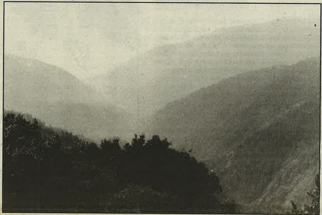
The King Range National Conservation Area.

to stop the BLM's closure plans. The BLM has tried various strategies to curb ORV use on Black Sands Beach and encourage "responsible" motorized recreation. However, the agency concedes that these measures "do not seem to have reduced the overall level of illegal use." In addition, conflicts between ORV users and hikers have increased dramatically.