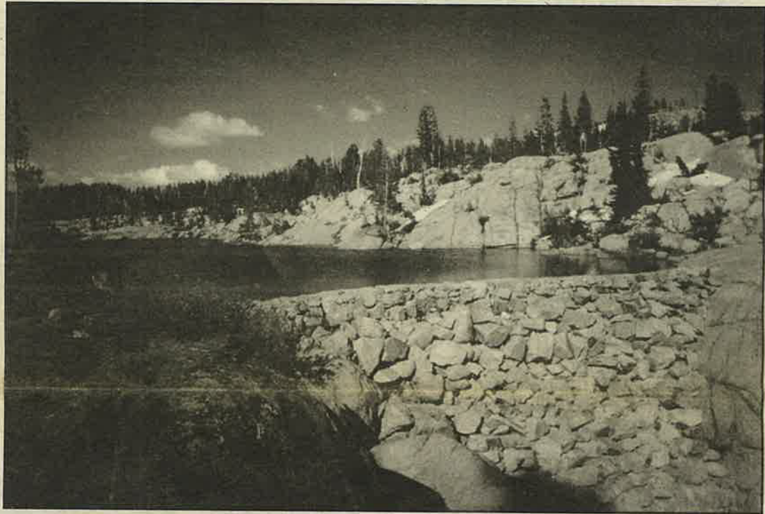
Y-Meadow Dam in the Emigrant Wilderness. This dam is 25 feet high and creates a totally artificial lake. Later, as the lake is drawn down mudflats and a bathtub ring become evident.

The purpose of the Wilderness Act was to assure that expanding civilization did not “...occupy and modify all