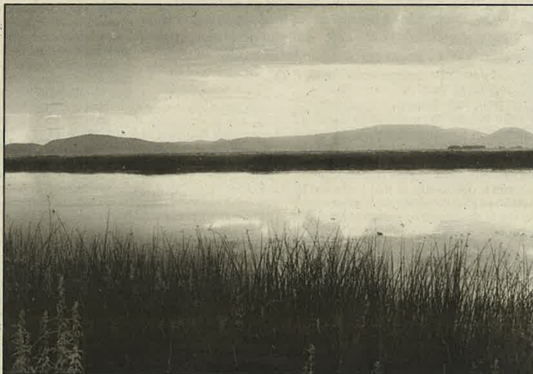
The Lower Klamath National Wildlife Refuge has 22,000 acres of land leased to farmers—to the detriment of migrating waterfowl.

Additionally, thousands of ducks and endangered fish died on Upper Klamath Lake in August and September due to bacterial diseases created by warming water temperatures. Even though the Bureau of Reclamation acknowledged they had over 150,000 acre feet in excess storage in two other area reservoirs, (enough water to flood 3/4's of the entire Klamath Reclamation Project's