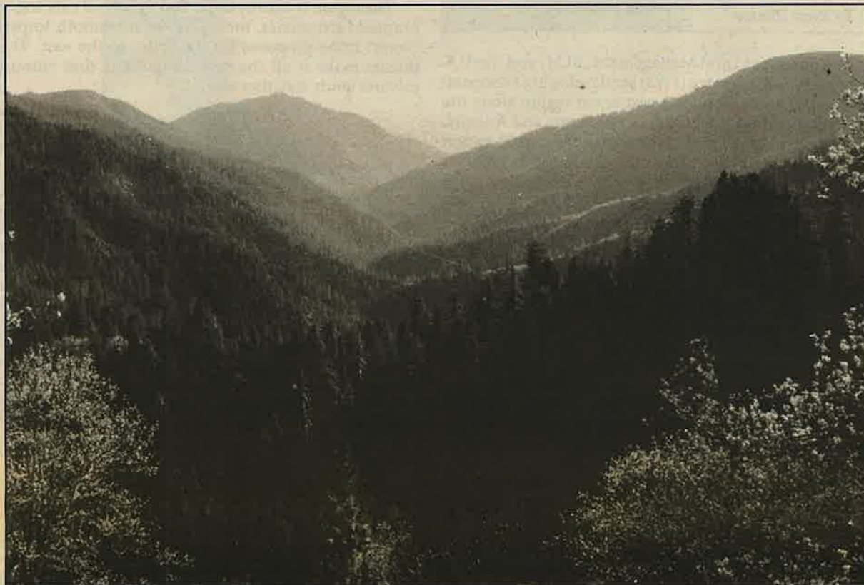
The wild and rugged McCloud River drainage could face a cure that is more destructive than its "disease": more logging and road-building.

The Forest Service claims that the FMZs are needed to prevent or control catastrophic wildfire. But little evidence is provided in the watershed analysis to prove that the FMZs would be effective. In fact, the opposite may be true. Recently ecosystem studies have concluded that logging actually increases fire severity. The FMZs would require the reopening of old jeep roads or the construction of new roads, which would increase human access to currently relatively inaccessible areas. Logging and even "fuel reduction" activities are known causes of