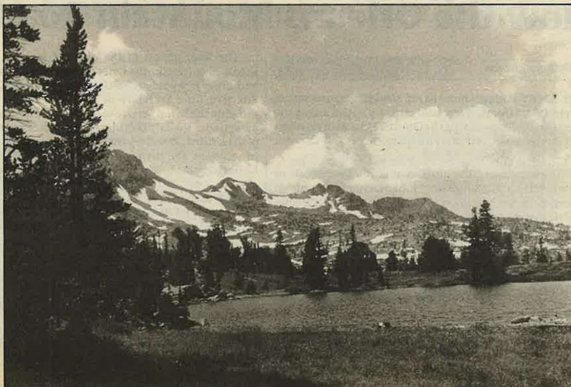
Frog Lake, Mokelumne Wilderness. The Forest Service's proposed management plan for the area backed away from their previous aim to limit the effects of grazing, stock use and shooting.

resources or the experience of other visitors. And because criteria for issuing exceptions are not clearly defined, it is impossible to predict how many exceptions the agency will actually grant. It is therefore questionable whether the proposed restrictions will have much effect in limiting the number and effects of large groups.