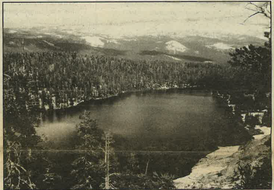
The California spotted owl management plan would have increased logging in the Sierra Nevada, jeopardizing numerous species—including the spotted owl itself. Cliff Lake, Dinkey Lakes Wilderness, Sierra National Forest.