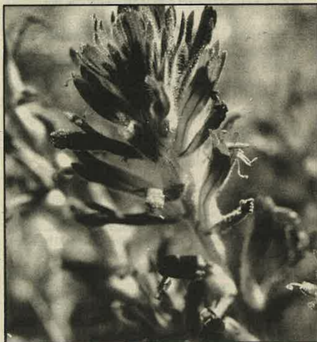
Soft-leaved Indian paintbrush ( Castilleja Mollis ), an endangered species, is now one of thirteen plants in Channel Islands National Park which were recently listed as threatened or endangered. All these plants face extinction unless destructive livestock operations on the islands are stopped.

Cameron Benson is a Staff Attorney for EDC. Reprinted courtesy of the Environmental Defense Center.