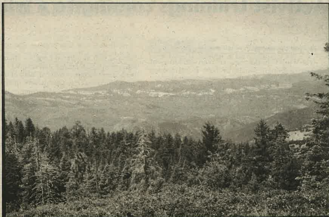
The BLM's Eden Valley Wilderness Study Area (background), as seen from the Mendocino National Forest's adjacent Elk Creek Roadless Area. Both areas are part of the proposed 70,000-acre Yuki Wilderness.

Conservationists applaud the BLM's efforts to protect and restore the wilderness values of the Eden-Thatcher region. The primitive nature of the area and its considerable botanical, wildlife, and watershed values make it worth preserving. For this reason, the California Wilderness Coalition has been seeking to have the Eden-Thatcher region designated in its entirety as the "Yuki Wilderness" for several years now in honor of the native people who