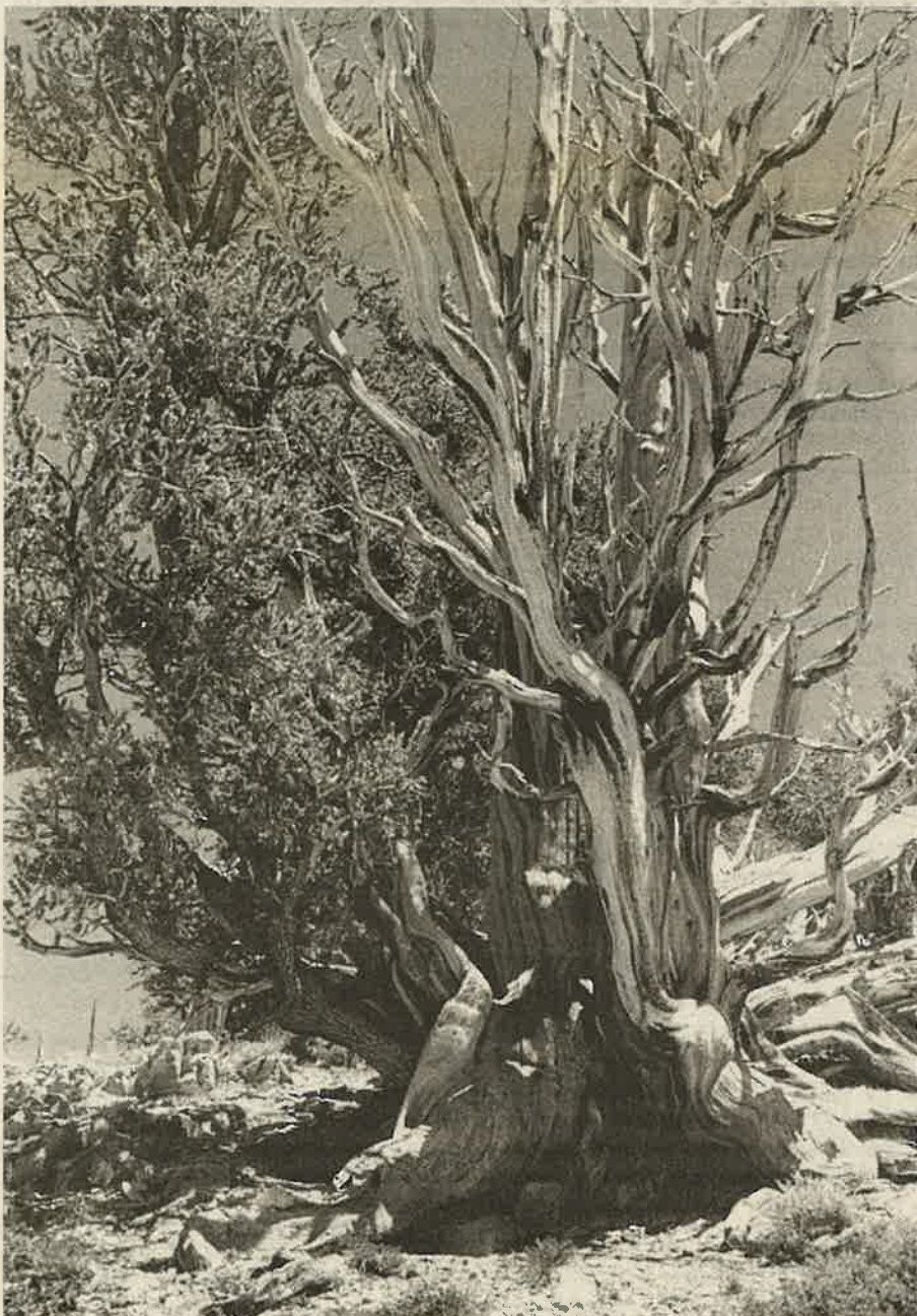
Bristlecone pines in the Inyo National Forest.

We opposed the rider-authorized logging of ancient forests in the Moonlight Creek, Indian Peak, and Granite