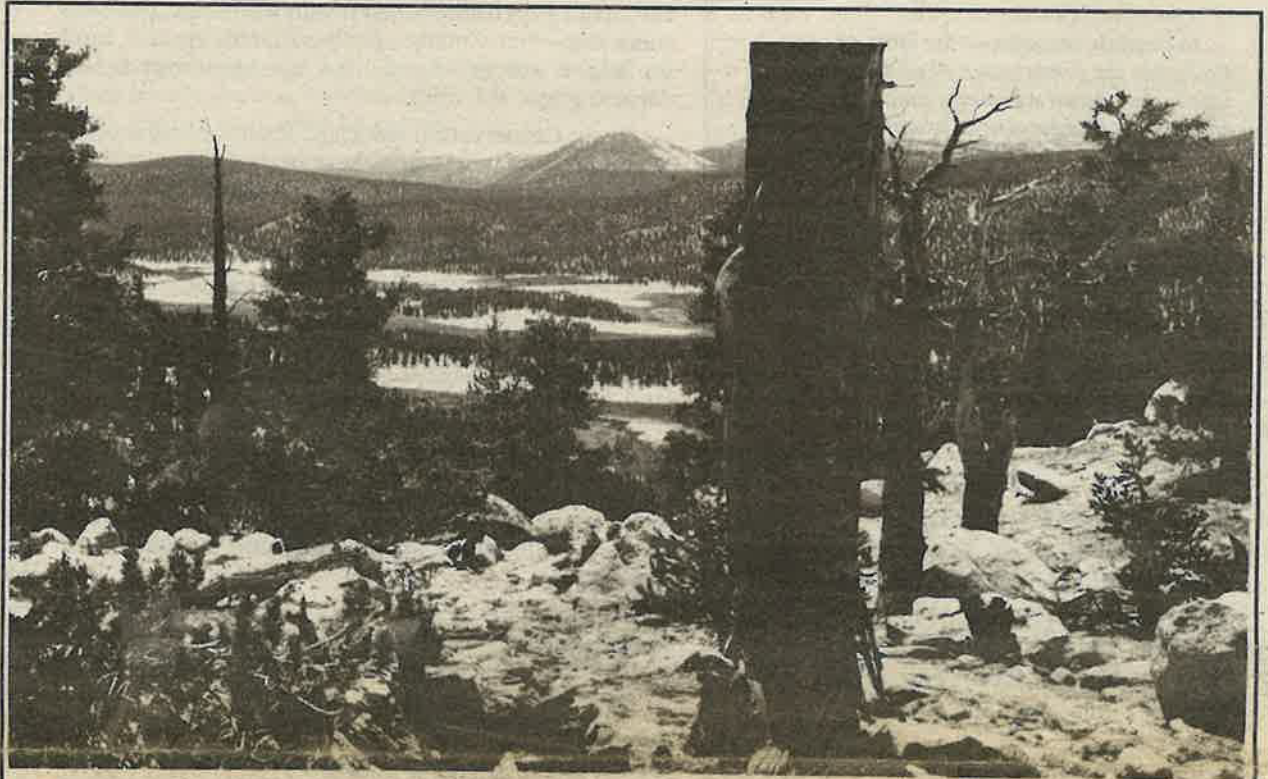
Whitney Meadows, Golden Trout Wilderness.