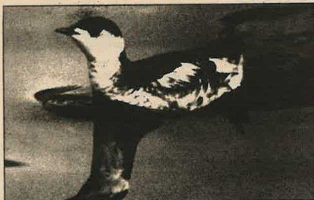
The marbled murrelet.

The real story of Headwaters—the trees and their unique ecology is long and rich. Unfortunately, however, today the story of Headwaters is eclipsed by a debate about its value: the perceived market value vs. the worth of a rare ecosystem.