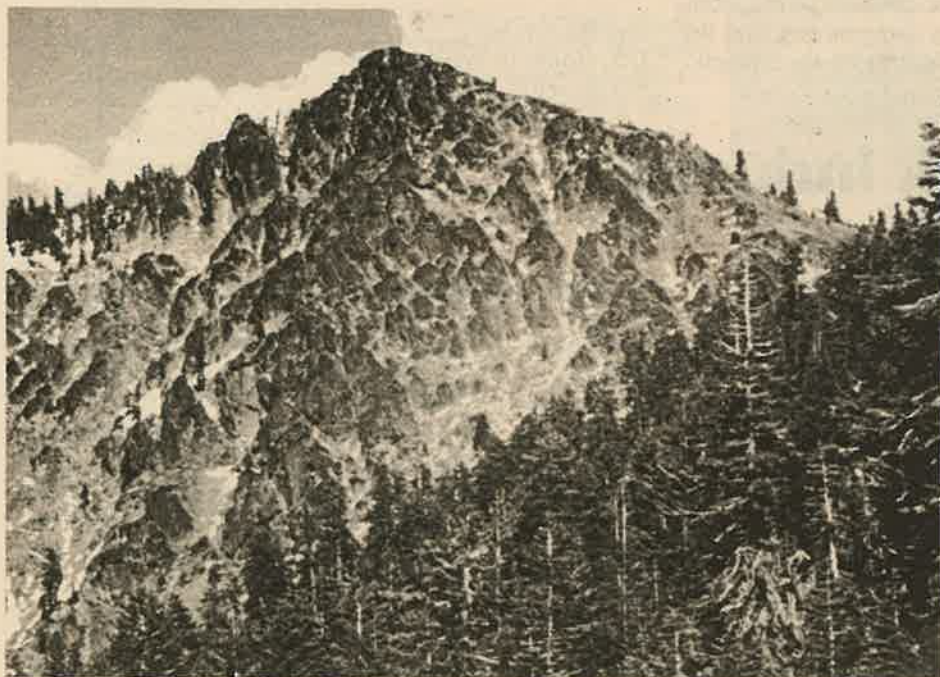
Beegum Basin lies on the slopes of North Yolla Bolly Peak, shown here.