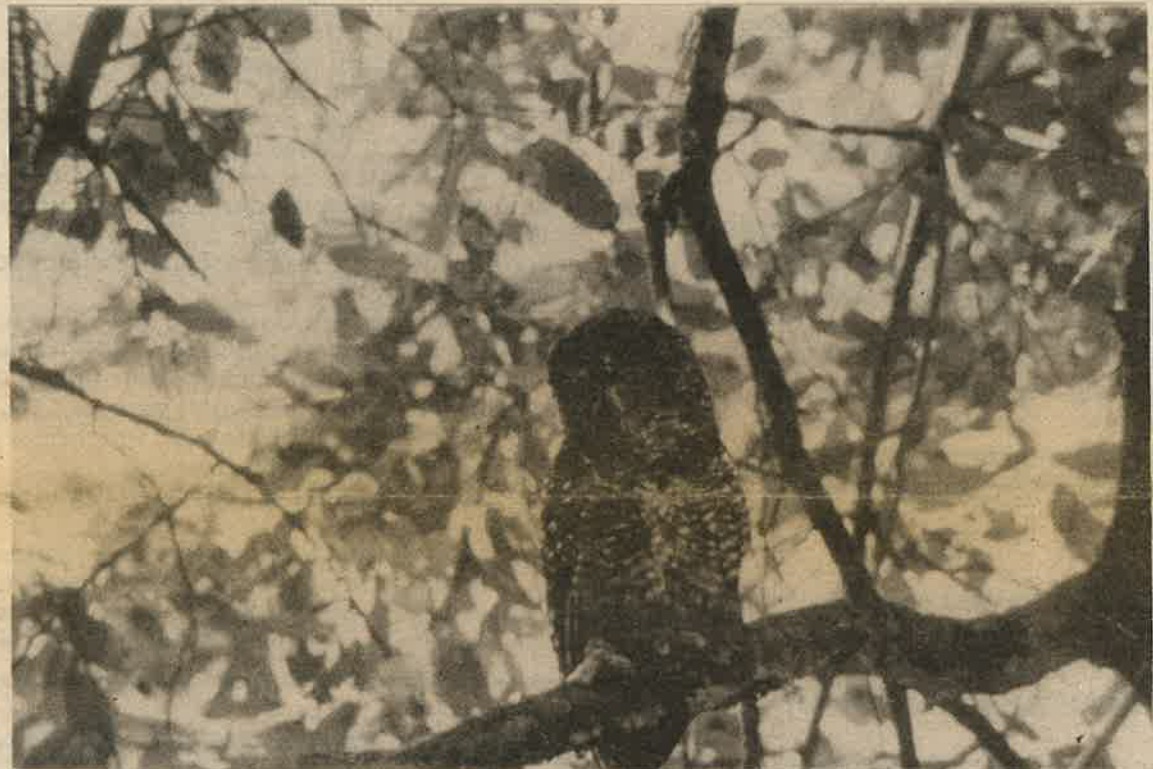
The California spotted owl, as well as the entire Sierra Nevada has been given a reprieve with the cancellation of the CalOwl EIS.