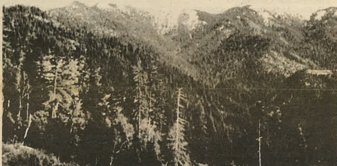
The Siskiyou high country, with the greatest conifer diversity on Earth, is threatened by salvage logging.