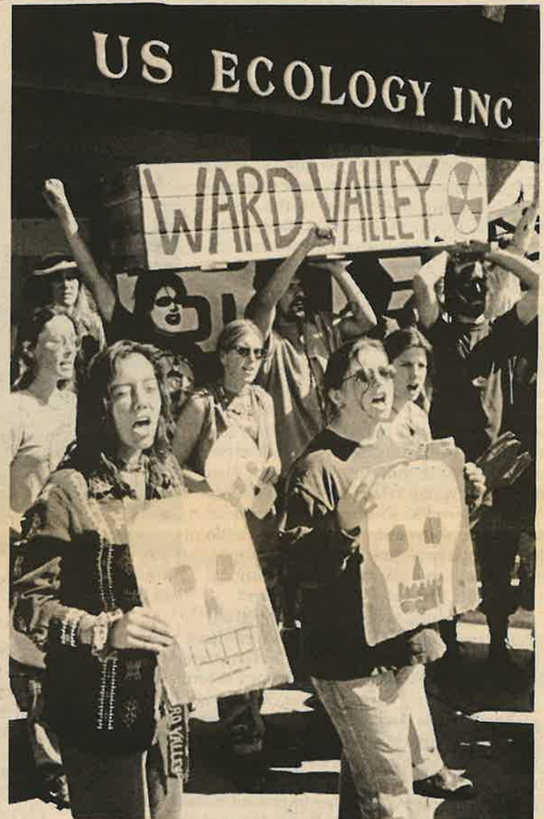
Protesters outside US Ecology's outpost in Needles, California.