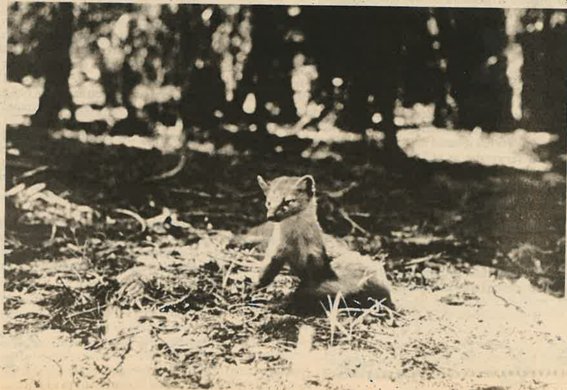
Pine marten, Tahoe National Forest