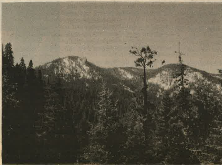
Slate Mountain Roadless Area, proposed as a new wilderness area under the Sequoia bill, had three salvage sales planned for it until recently.

Conservationists in Oregon and Washington have done an outstanding job of making the rider a key political issue in the Pacific Northwest. Activists in California, however, have had to concentrate their efforts into stop-