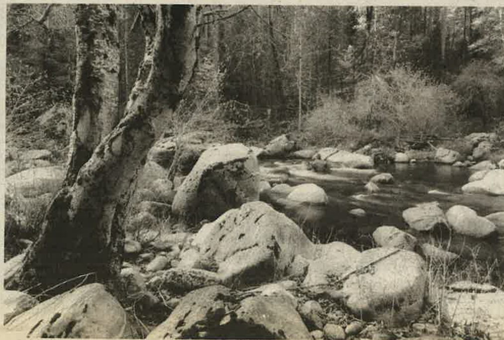
North Fork of the Mokelumne River, at the Devil's Nose site.

Community-based organization Foothill Conservancy led the local fight against the dam, with support from