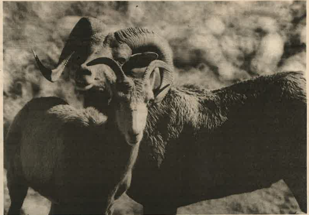
Nelson bighorn ram and ewe

The Mt. Baxter population is actually two separate herds: one at Sand Mountain and one at Sawmill Canyon. When the Sand Mountain herd was counted in winter,