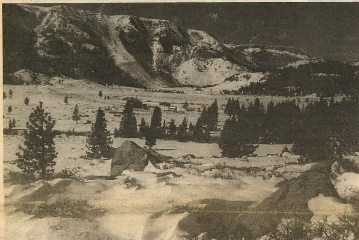
Sherwin Ridge is popular with hikers and cross-country skiers. But a plan to build a golf course threatens the Inyo National Forest roadless area.