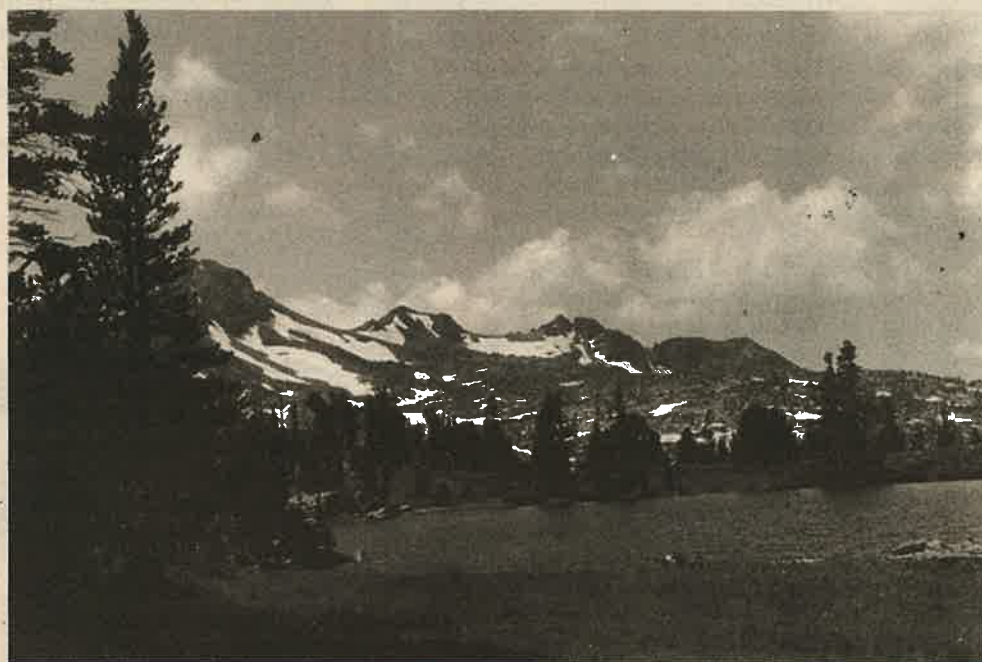
Frog Lake in the Mokelumne Wilderness.

As expected, the environmental assessment claims there is no proof that enough silver is accumulating to harm the environment. The document does acknowledge that silver is toxic to aquatic and semi-aquatic organisms but contends that pollution from cloud seeding is probably not a cause of the disappearance of mountain yellow-legged frogs from High Sierra lakes and streams. The environmental assessment says silver accumulation in soil or water is not likely to be a problem