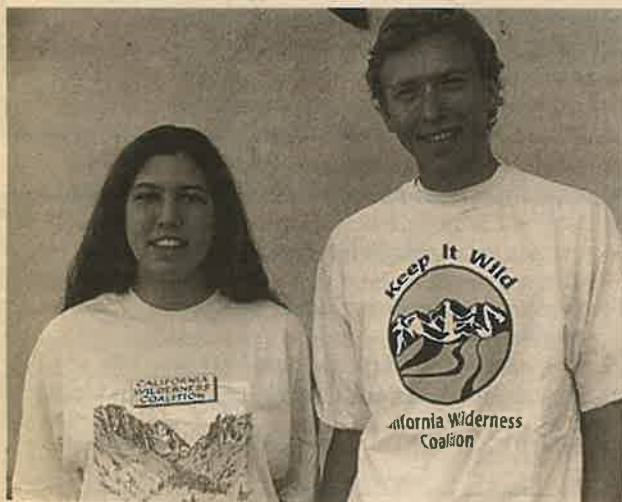
CWC T-shirts (order form on page 8)