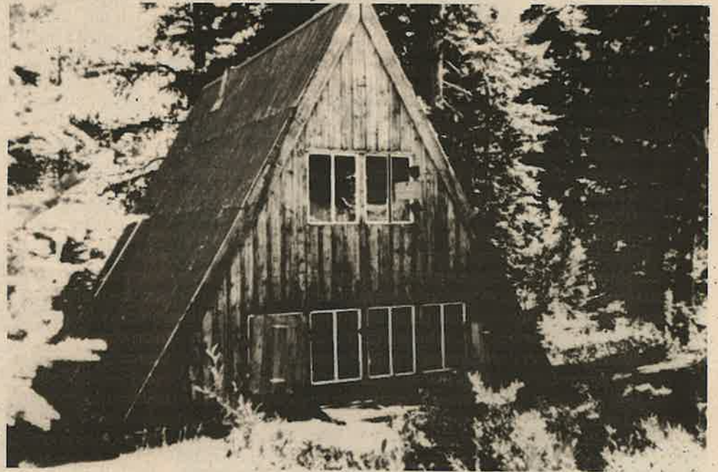
Bradley Hut in the Granite Chief Wilderness.

Although the 1964 Wilderness Act defined wilderness as a place "without permanent improvements or human habitation," there is no shortage of structures in wilderness areas (one survey found 119 cabins and shelters in the wilderness areas of California's national forests alone). Some are historic structures. Others are associated with mining claims or grazing allotments. The Forest Service has lookouts and other buildings in the wilderness for its