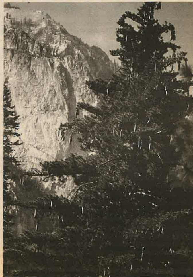
Sugar pine (with unopened cones) on Copper Creek Trail, Sequoia-Kings Canyon Wilderness.