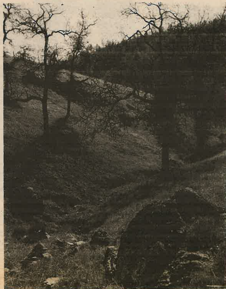
The Coalition launched the drive for wilderness on state lands. The 22,000-acre Henry W. Coe Wilderness is one of the few to preserve one of California's least-protected ecosystems—oak woodlands.