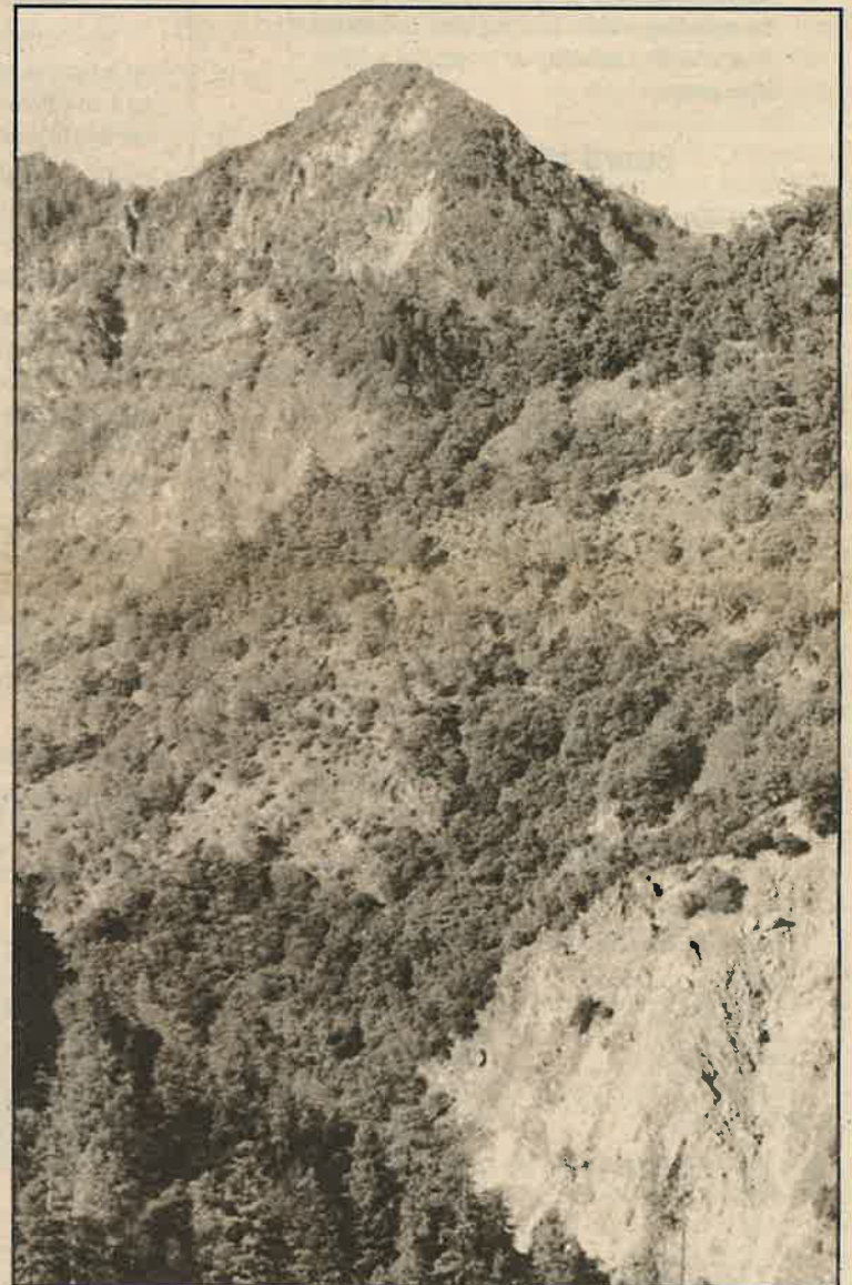
Now spared from clearcuts, the Cow Creek Roadless Area is sacred to Native American tribes and home to old-growth dependent species.