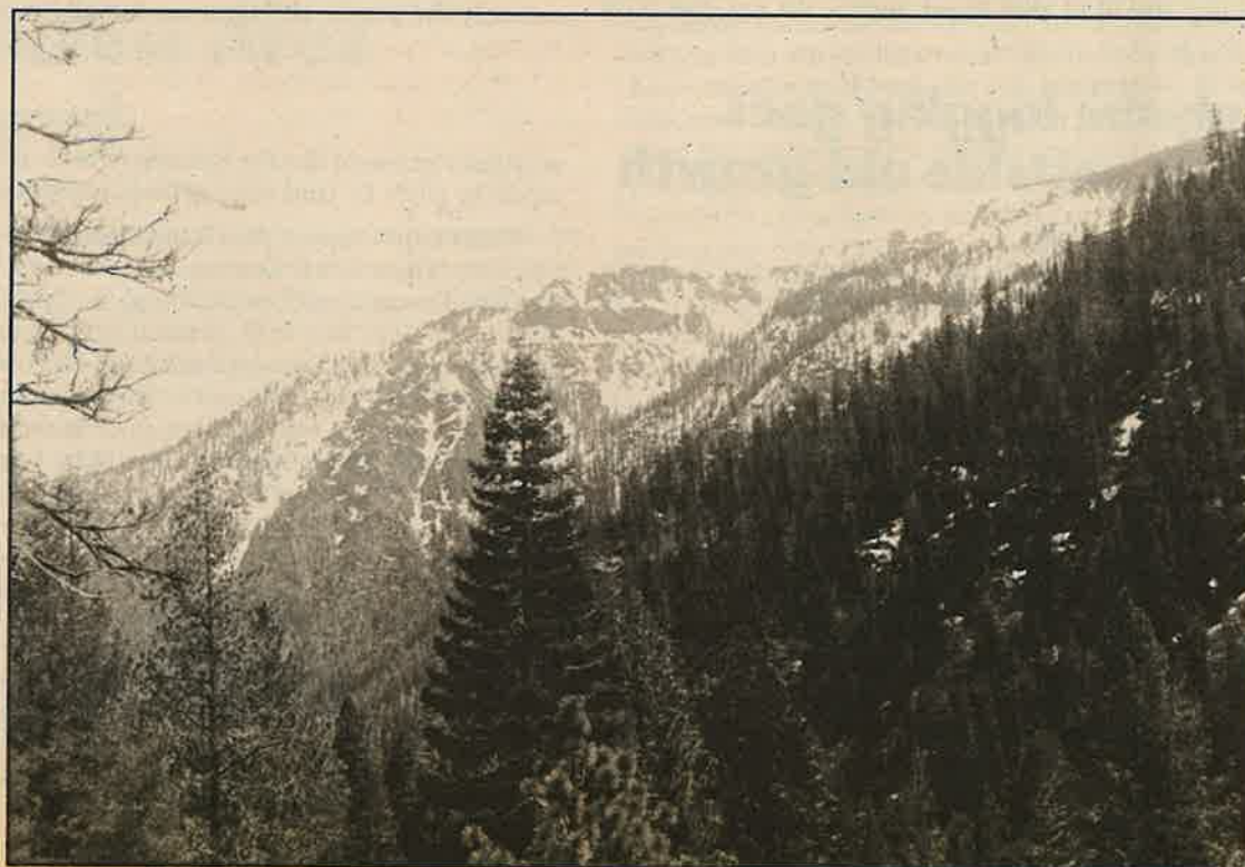
The Raymond Peak Roadless Area was saved from logging last year, but now it is threatened again by Forest Service logging proposals. Toiyabe National Forest

Rare eastside Sierran old-growth forest grows in the roadless area, and sadly, a University of California at Davis study (called the SNEP report) recently found that only nine percent of the ancient forest that once graced the slopes of the eastside Sierra still exists today. Because of its unique ancient forest habitat, the Raymond Peak Roadless Area hosts (or is likely to host) several threatened wildlife species, including northern goshawk, California spotted owl, great gray owl, white-headed woodpecker, fisher, marten, and wolverine, among others. The Forest Service's proposed logging plans will degrade this habitat and could drive these species closer to extinction.