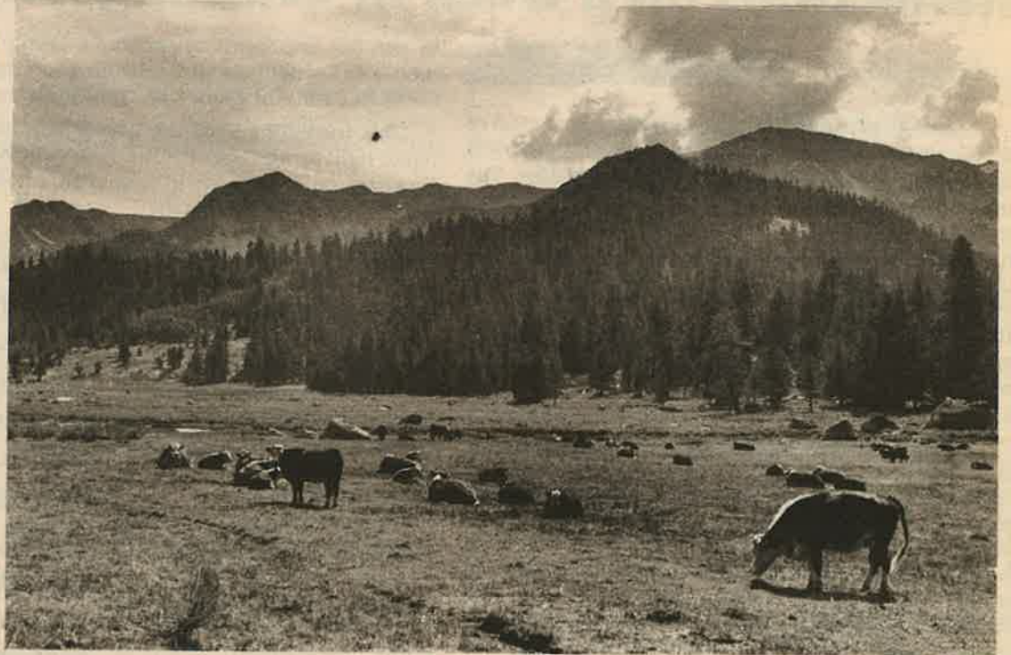
Cows grazing in the Carson-Iceberg Wilderness. A wholesale giveaway to the ranching industry has been averted this year.

To his credit, President Clinton stood firm in defense of sound public lands grazing policies and vetoed every bill containing these provisions. Senator Domenici's defeat is, thankfully, yet another failure of the 104th Congress to pass its contract on the environment.