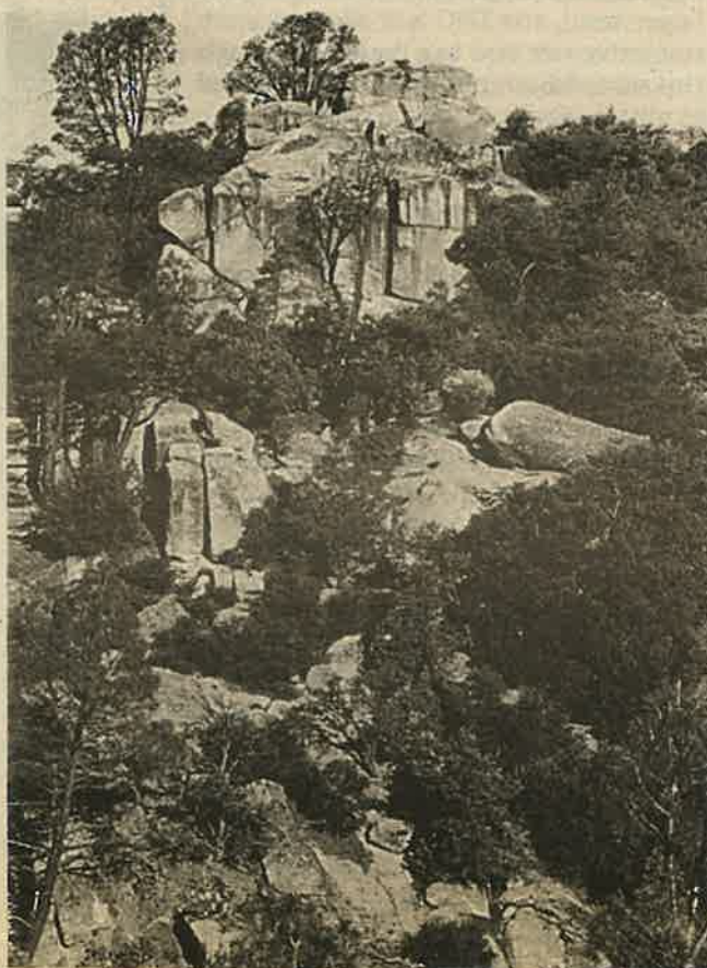
Dome Land Wilderness was expanded to the east by the California Desert Protection Act of 1994.