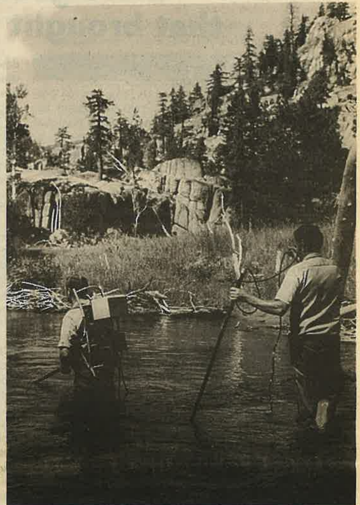
Electrofishing on the East Fork of the Carson River, Carson-Iceberg Wilderness, where the Department of Fish and Game is restoring populations of threatened Lahontan cutthroat trout.

This federally listed threatened species historically occurred throughout the Little Kern River drainage in