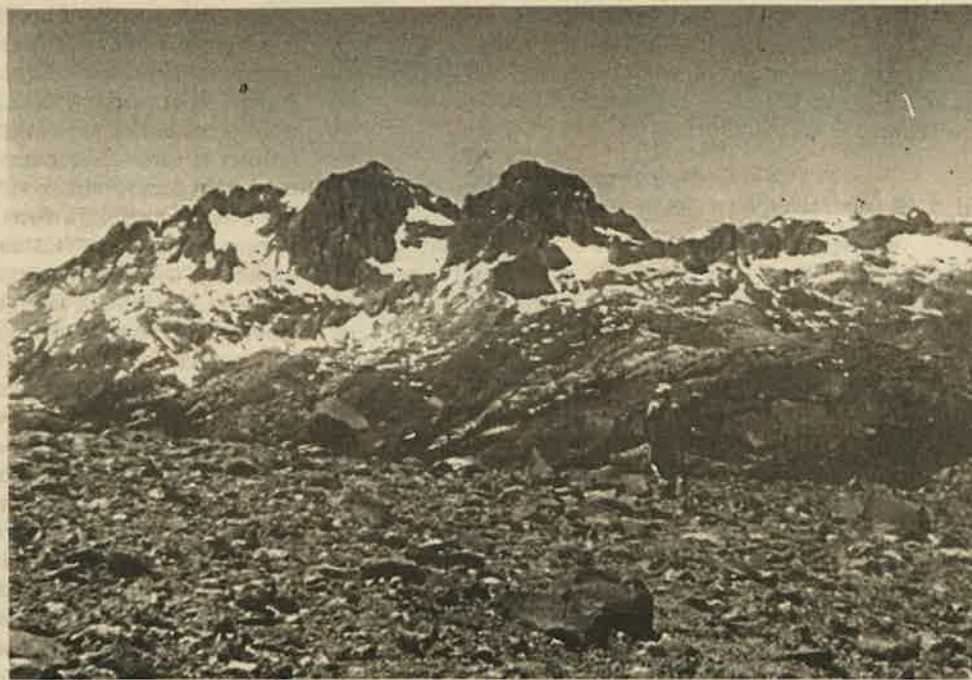
The Forest Service's "desired condition" for the San Joaquin Roadless Area does not include wilderness.

Local environmentalists are still reviewing the document. Besides requesting that the agency either make a commitment to real ecosystem protection or abandon the