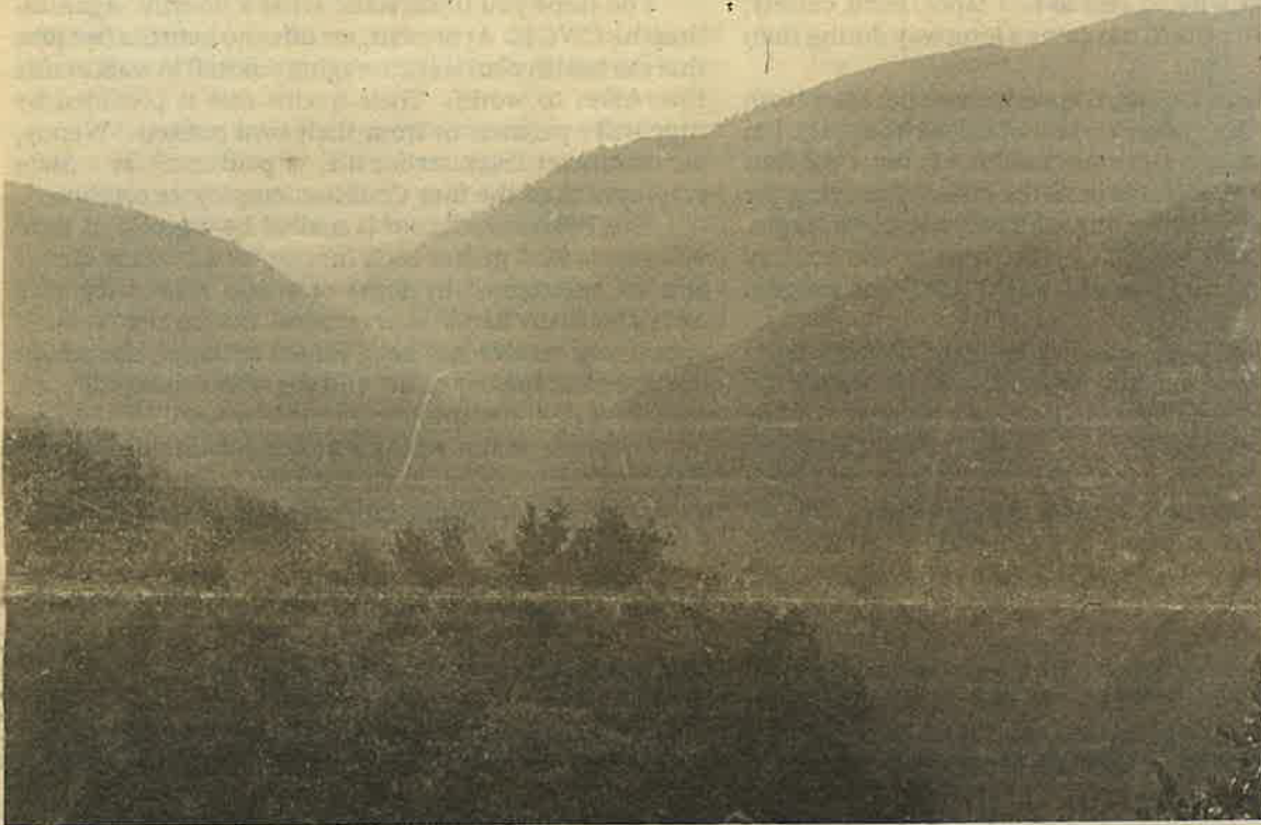
The King Range is again threatened—this time by a wilderness bill.