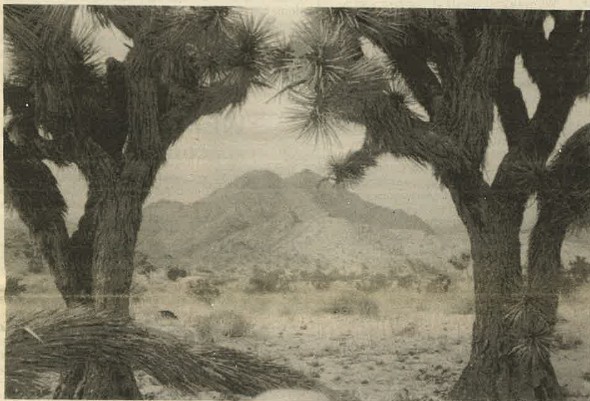
Joshua trees frame the future Cady Mountains Wilderness