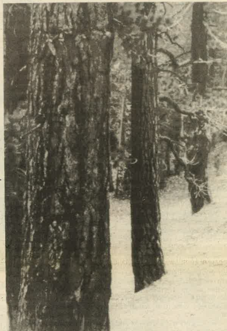
Old-growth Jeffrey pine, San Joaquin Roadless Area, Inyo National Forest