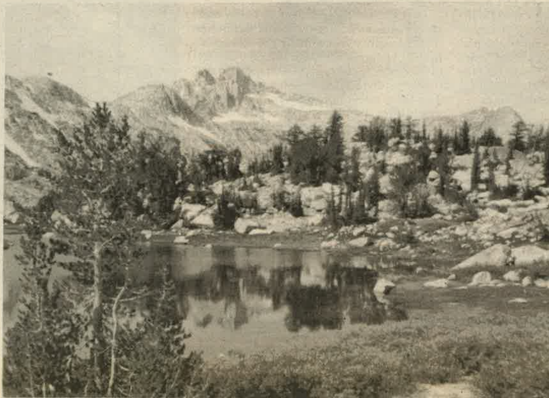
In Three Corners country: Tower Peak from Rainbow Canyon

As soon as the fish are dropped into these lakes, they start to eat. They eat just about anything they can catch, and many of the prey organisms have no evolutionary imperative to escape. The result is that native aquatic ecosystems are destroyed as endemic species of shrimp, amphibians, and other organisms are decimated. Research in the Sierra has shown that the stocking of non-native trout significantly alters natural aquatic communities, and, as in the case of the mountain yellow-legged frog, it sometimes sends species to