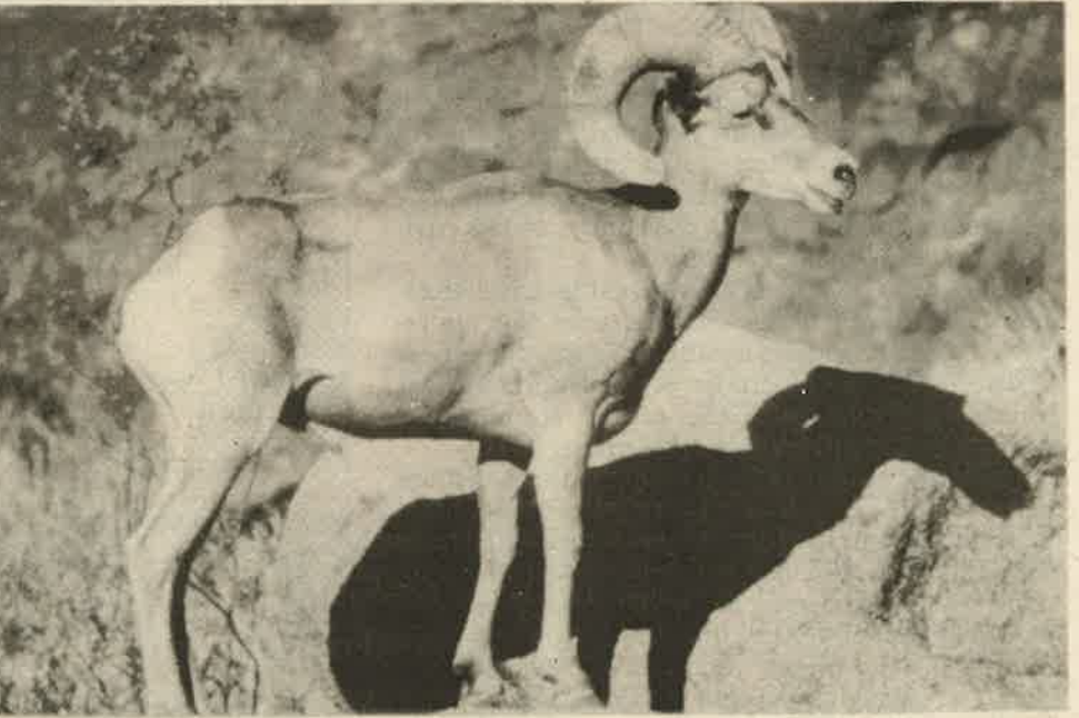
Hunters have their sights on bighorn in the proposed Mojave National Park, and Congress may accommodate them.

If the past decade is any indication, salvage sales are the foremost threat to roadless areas in California, surpassing even green sales and road construction projects in the amount of acreage lost. In the past five years alone, for example, 35 of the 52 logging proposals for roadless areas in California have been salvage sales. Most roadless areas