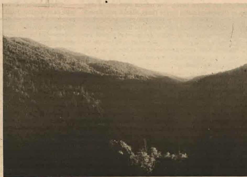
Brush Mountain in the proposed Cahto Wilderness

The Cahto (pronounced kah-toe) controversy began when the BLM lands around the South Fork Eel River were left out of the agency's wilderness study inventory. In 1976, when Congress passed the Federal Land Policy and Management Act which mandated the inventory of candidates for wilderness study area status, the BLM owned three parcels near the South Fork—Brush Mountain, Elkhorn Ridge, and Cahto Peak (see map). The Brush Mountain and Elkhorn Ridge parcels each were smaller than 5,000 acres, the usual (but by no means absolute) minimum-size criterion for wilderness designation, and consequently were not selected as wilderness study areas. The BLM's Cahto Peak parcel exceeded the 5,000-acre