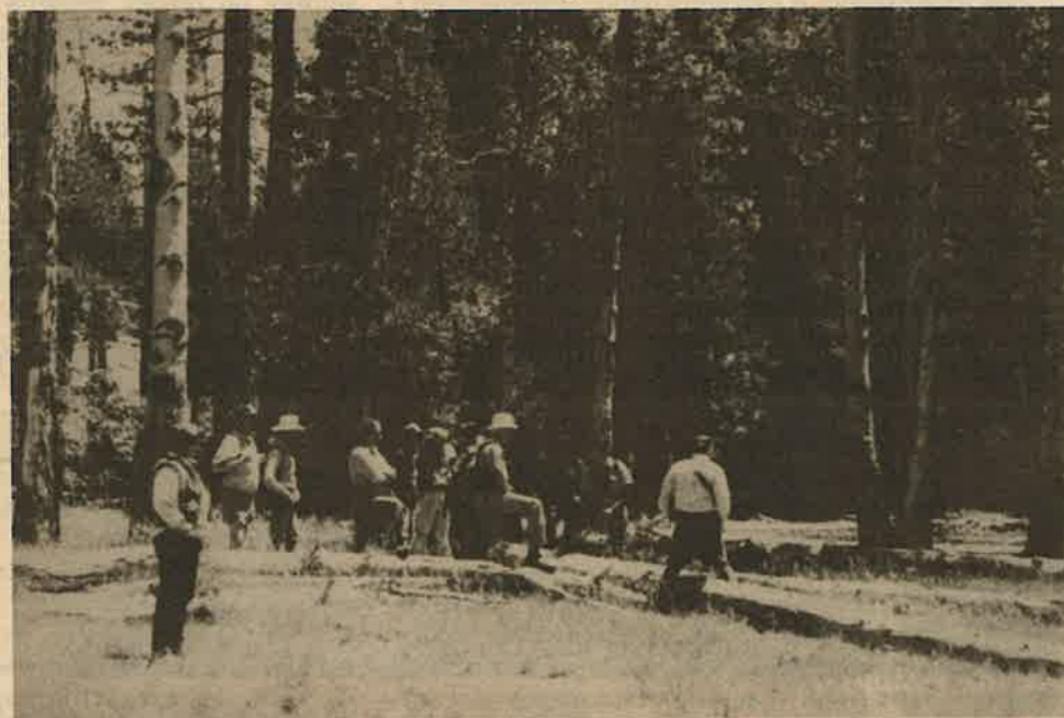
Participants in a recent field trip in the Caples Creek Roadless Area examine an overgrazed aspen grove.

Some of the Forest Service employees seemed surprised to find the environmentalists more concerned