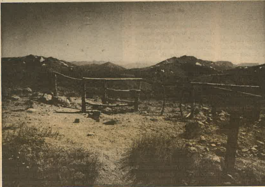
Cattle fences along the Pacific Crest Trail south of Ebbetts Pass

importance is the BLM's proposal to allow ranchers to stop grazing their allotments for up to three years for "personal or financial reasons," and for up to ten years to allow the land to recover from grazing, without losing their permits or having their allotments grazed by other ranchers. Under current rules, ranchers either must graze their allotments or lose them.