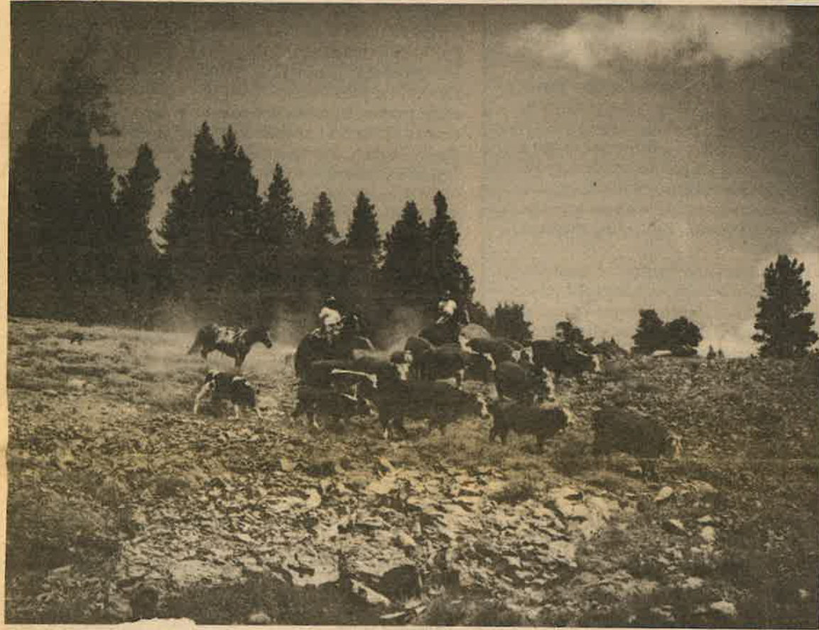
Cattle in Kennedy Canyon north of Yosemite Wilderness