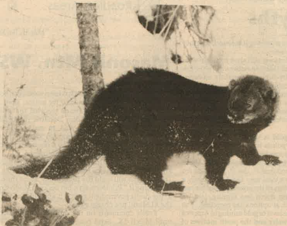
Fishers have the unique ability to prey on porcupines for food—an often fatal endeavor by less-skilled hunters.