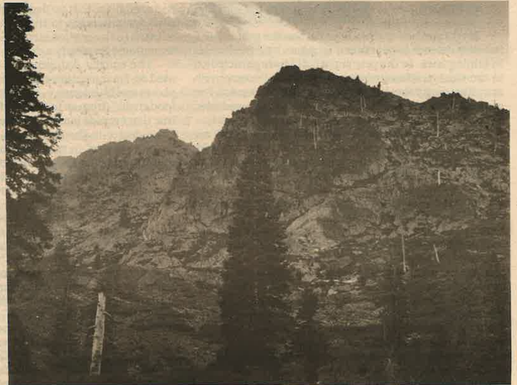
Red Buttes Wilderness is one of the few protected pieces of the Siskiyou.

At about the same time the pines moved in, the Klamaths began a steady rise yet again, along with the Cascades. Similar mountain building continues today and is evidenced by the deeply-cut river courses.