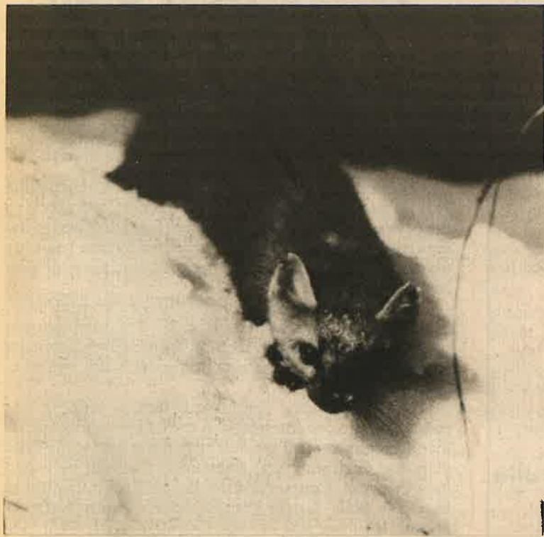
Female marten in snow, Tahoe National Forest. The marten has little body fat and must continue to hunt tree squirrels and other prey that remain active above and below the snow in winter, when starvation is a constant threat.