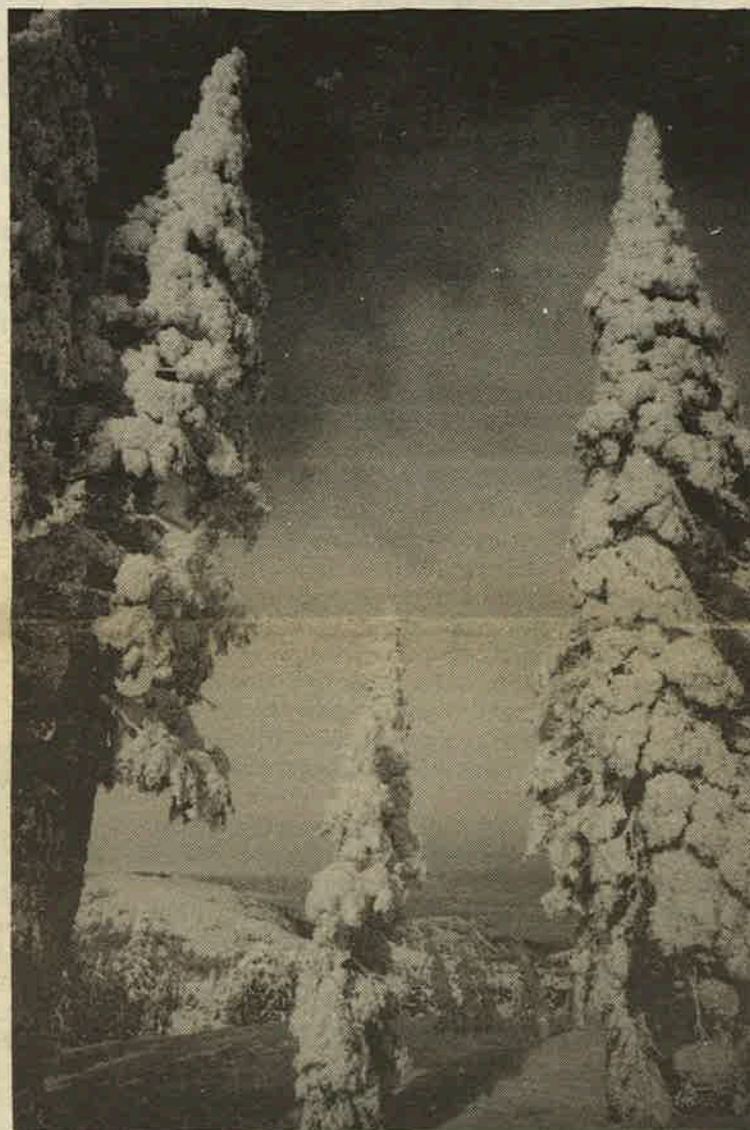
Winter, Castle Peak Roadless Area. Money appropriated by Congress will allow the Trust for Public Land to buy inholdings along the Pacific Crest Trail. Castle Peak is just one of the wildlands the CWC worked to protect in 1994.