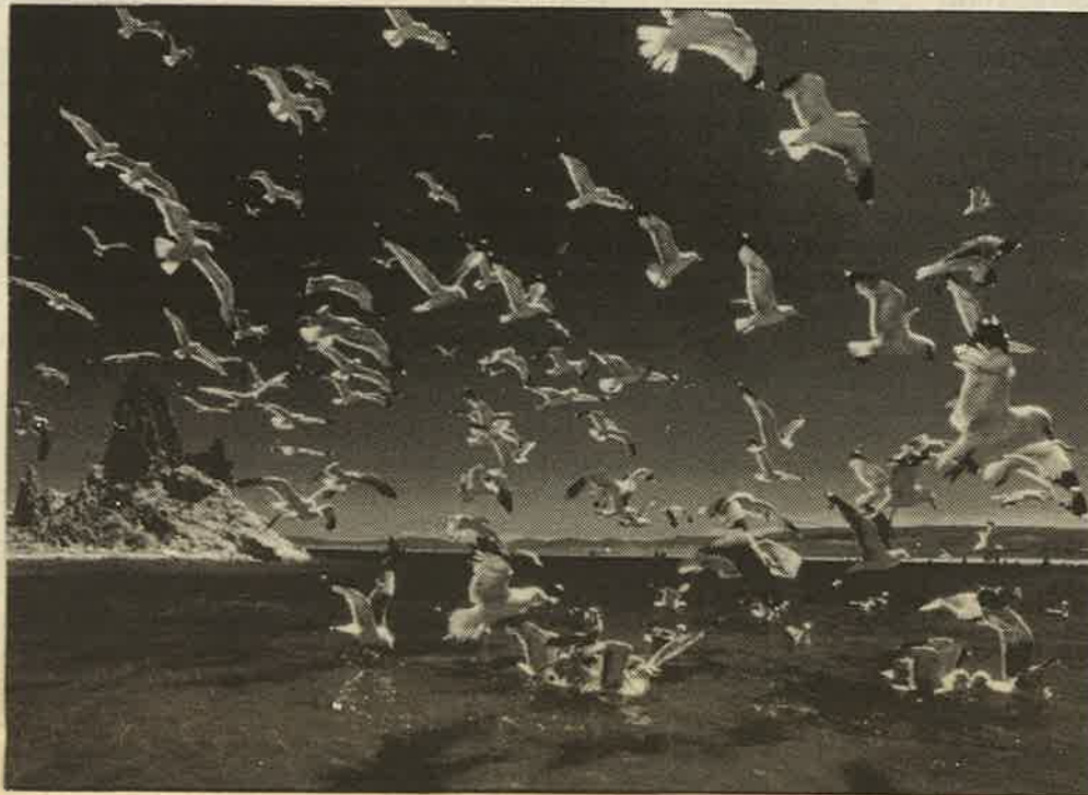
California gulls at Mono Lake