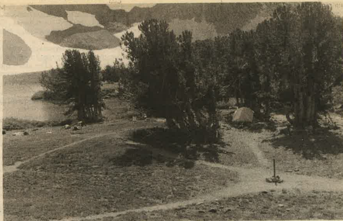
The minimum-impact message hasn't reached these campers at Round Top Lake in the Mokelumne Wilderness.