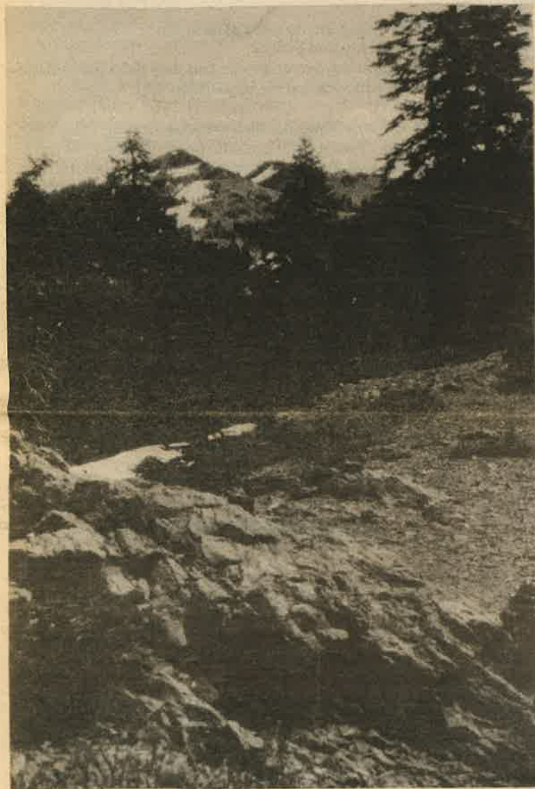
South Yolla Bolly Peak and Mt. Linn are popular destinations in the Yolla Bolly-Middle Eel Wilderness.