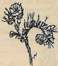
Nine Mile Canyon Phacelia

On the other hand, if you do want to identify a flower and learn its range in California, the sort of habitat it grows in, whether it is adaptable to gardens (and if so, where), if it is uncommon or rare, or almost anything else (except what time of year it blooms), The Jepson Manual is not only the authoritative source, but a rather easy-to-use source at that. The key to plant families is surprisingly straightforward, although it is still possible to go astray. Once you