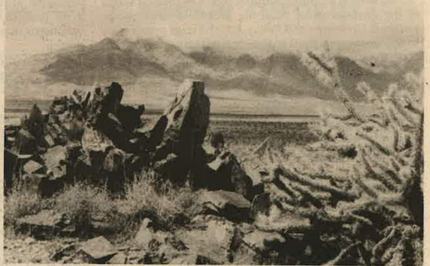
South Providence Mountains

Old Dad Mountain West of the Kelso Mountains, this extensive wilderness encompasses a sand hummock, the Mojave river sink, and the sand hills of Devil's Playground along with Old Dad Mountain itself and the Cowhole Mountains. Devil's Playground and the sand hummock are noteworthy for their sand-dwelling species: mesquite, desert iguanas, shovel-nosed snakes, zebra-tailed lizards, and sidewinders. Prehistoric sites dot the landscape in surprising numbers, and Old Dad Mountain supports a