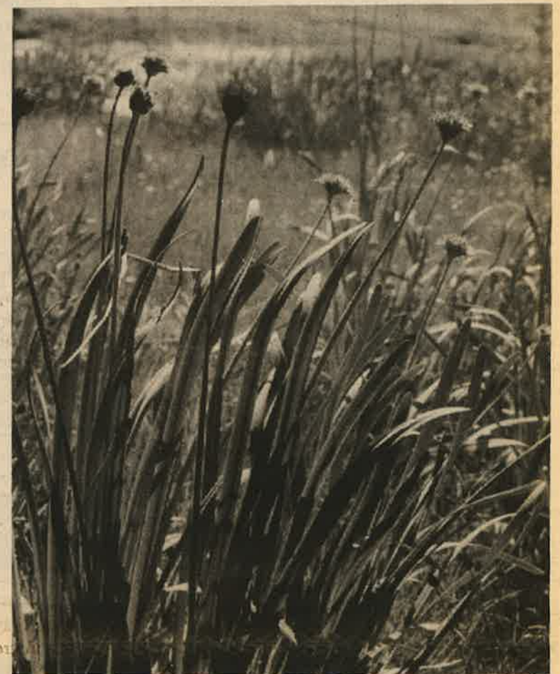
Picking edible vegetation is legal, but unless the plant is abundantly available, like these wild onions near the Dana Fork of the Tuolumne River, leave it be.

Second, ask yourself whether what you want to collect could be gathered someplace other than wilderness. Though some kinds of collecting may not harm the wilderness itself, we still can abstain from collecting out of respect for what wilderness represents. We may differ in our perceptions of wilderness, but a convenience store it's not.