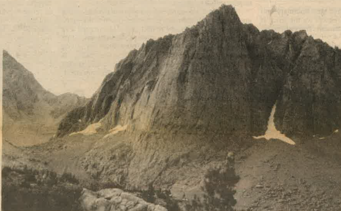
Temple Crag, John Muir Wilderness

As the PIT process continues, we will have updates on the group's progress.