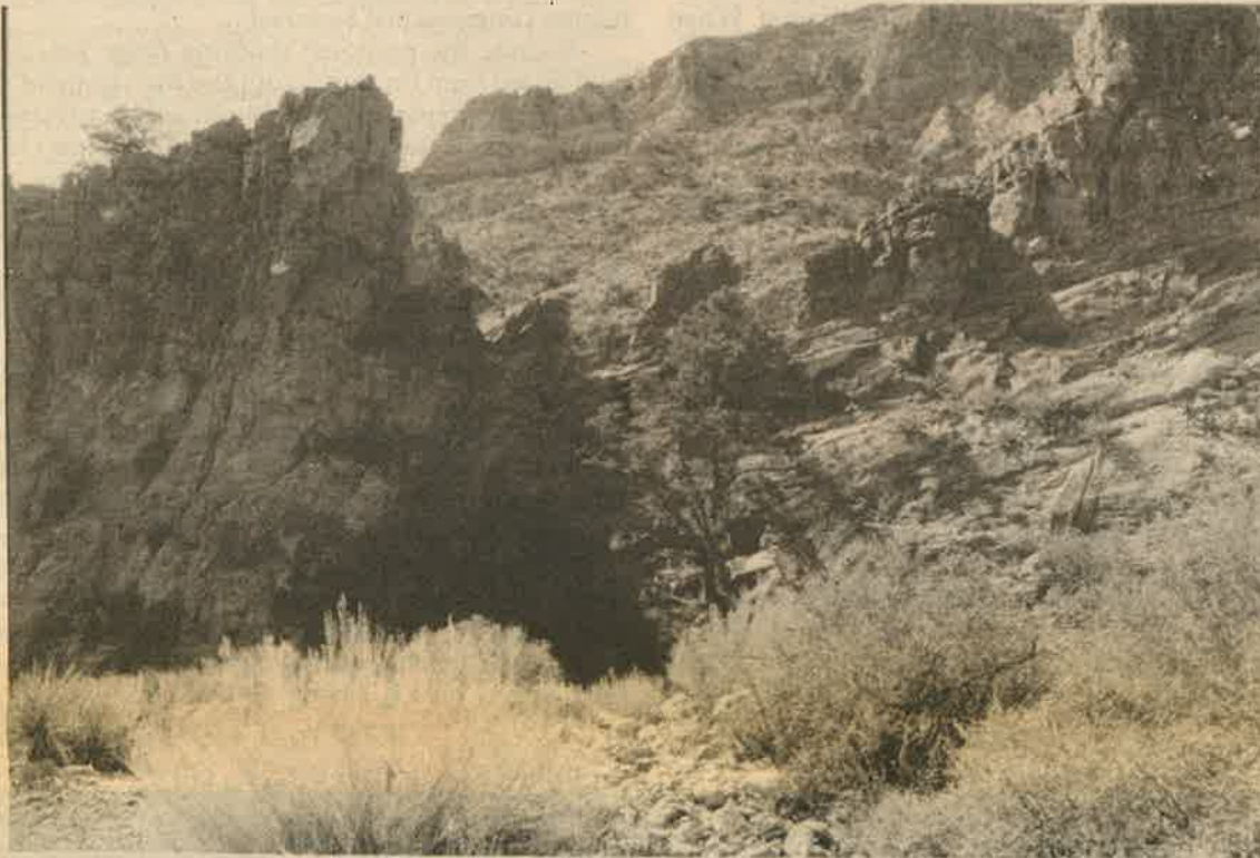
Woods Wash in the future Mojave Wilderness.

In all, 1,727 acres of bountiful beauty and biodiversity have been added to the public trust, thanks to the Trust for Public Land.