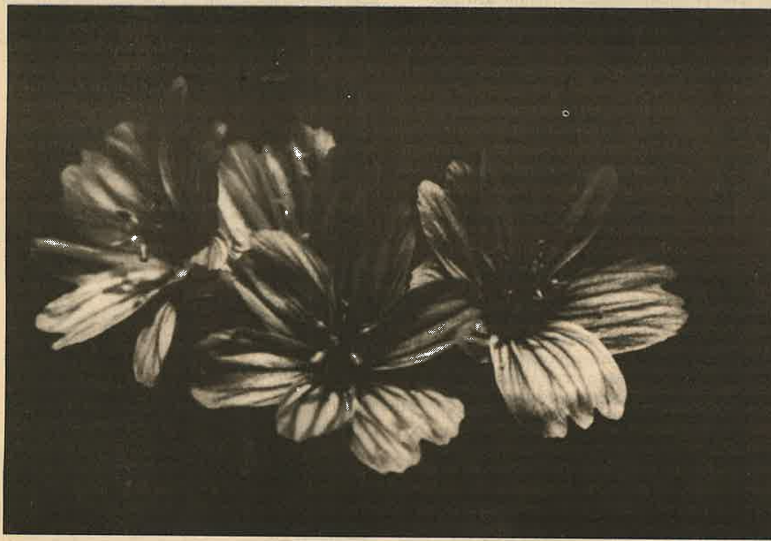
Congdon's Lewisia ( Lewisia congdonii )