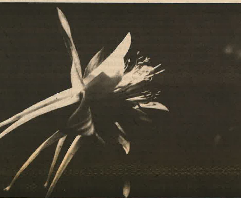
Rock columbine ( Aquilegia pubescens )

ally extinct. Even subalpine and alpine meadow areas have been affected. Research by geographer Thomas Vale has shown that tree invasion of meadows in the high Sierra is correlated with sheep grazing. Once the sheep were removed, the disturbed soils were ideal for tree seedling germination, resulting in an overall reduction of subalpine meadows. Loss of meadows means fewer feeding opportunities for everything from yellow-bellied marmots to pikas.