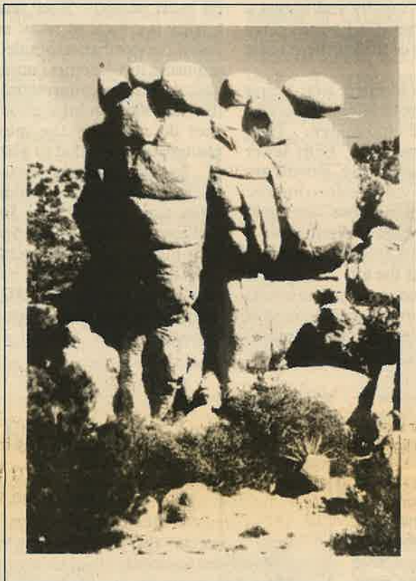
This rock formation in Caruthers Canyon will be protected inside the Mojave National Park when the desert bill is passed.

The senator assured activists that, given his colleague's rejection of the compromise, he no longer feels bound by it. Since Sen. Seymour will not help the desert, Sen. Cranston urged activists to work on gaining support from senators in other states. Sen. Cranston told the Los Angeles Times that if he is unable to get his bill passed this term, he thinks it could be passed next year if Rep. Barbara Boxer and Dianne Feinstein, who support his bill, are elected to the Senate.