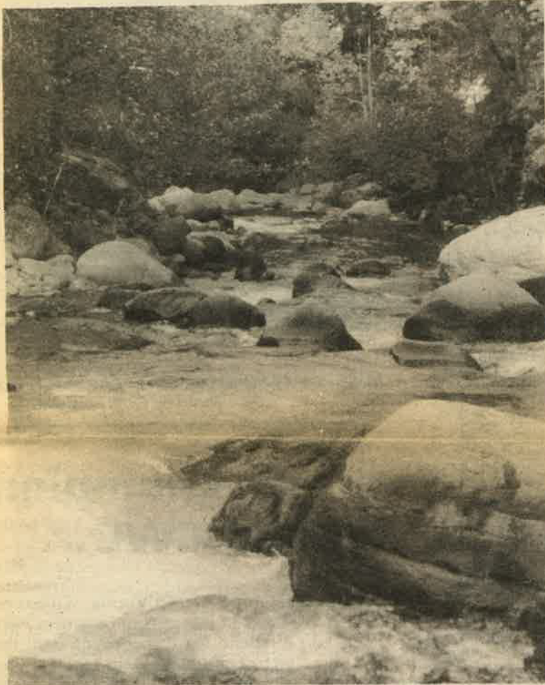
This portion of the Mill Creek Roadless Area is proposed for wilderness in the Lassen forest plan.