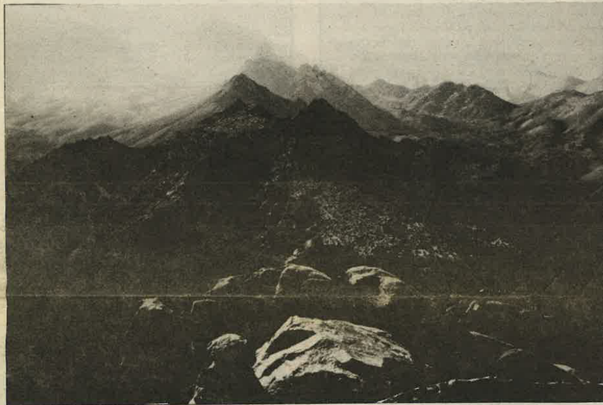
View north from Aquila Peak (Five Fingers) on the eastern edge of Owens Peak WSA in the California Desert Conservation Area.