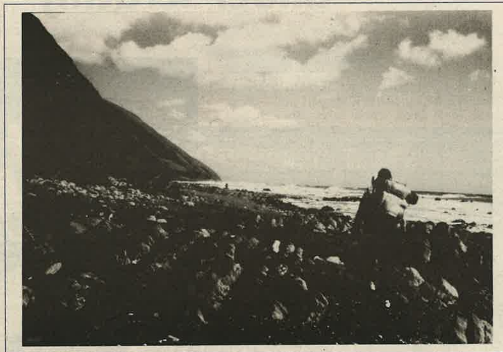
A backpacker travels the coast trail south of Punta Gorda in the King Range WSA.