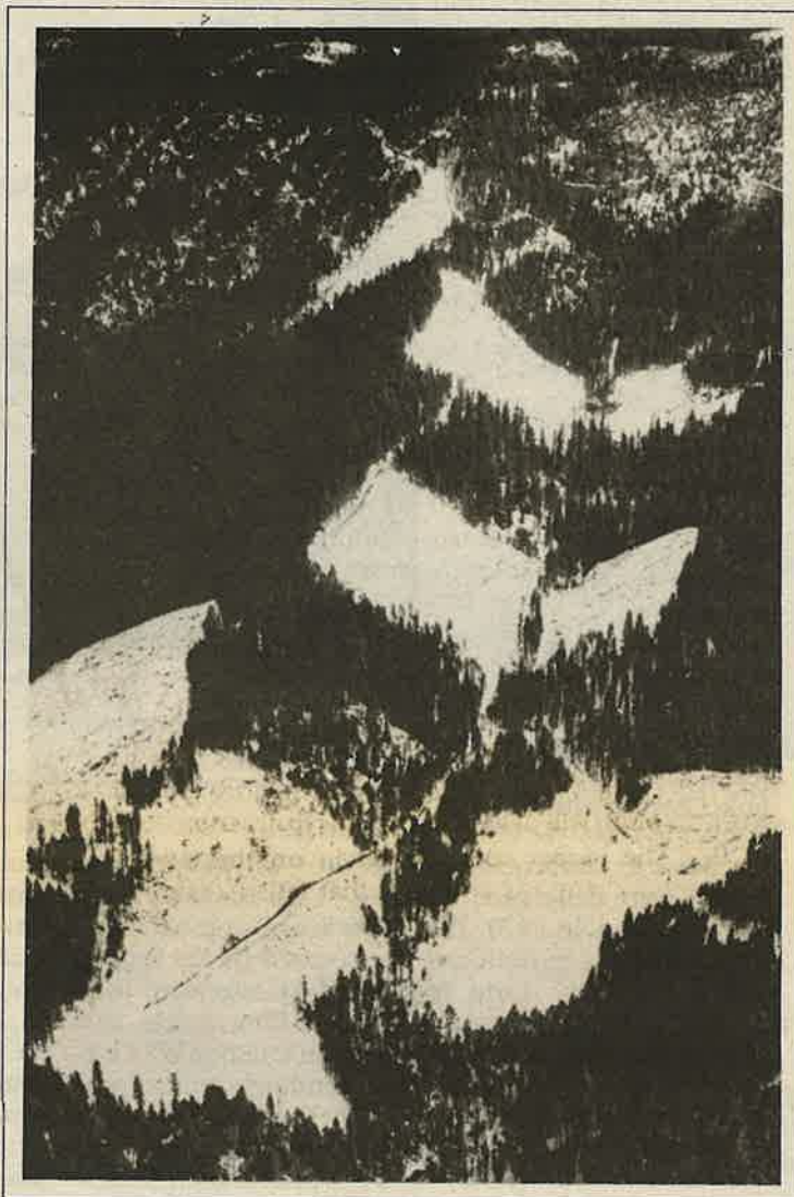
Clearcuts in Sequoia N. F.