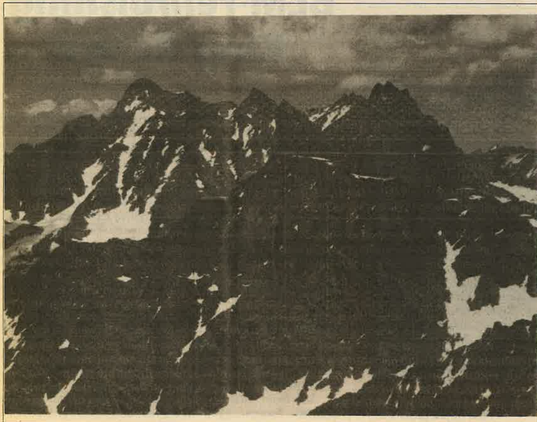
The Palisades: Sequoia-Kings Canyon Wilderness and John Muir Wilderness.