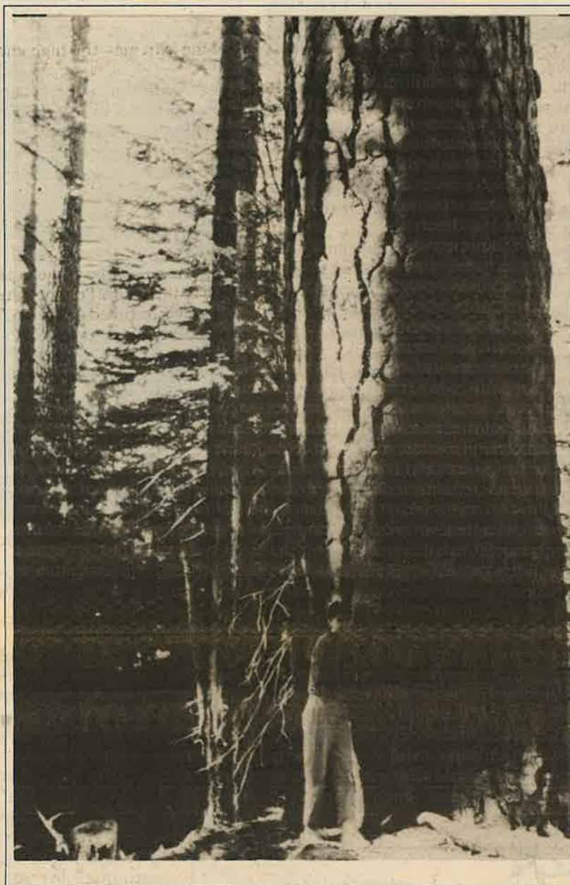
This stand of old-growth mixed conifers may disappear; under the final Stanislaus plan, 90 percent of the North Fork Stanislaus Rim will be opened to loggers.

Even if the optimists are right on the "wildlife"