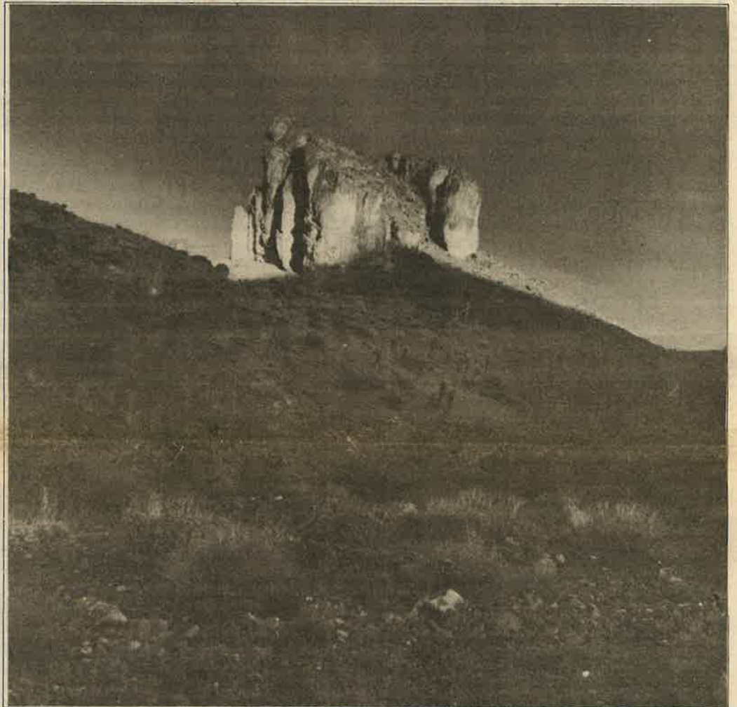
Light breaks over Whipple Mountain Wilderness Study Area, which would be protected as wilderness in the Desert Bill.

The margin by which the House bill finally passes is considered important continued on page 4