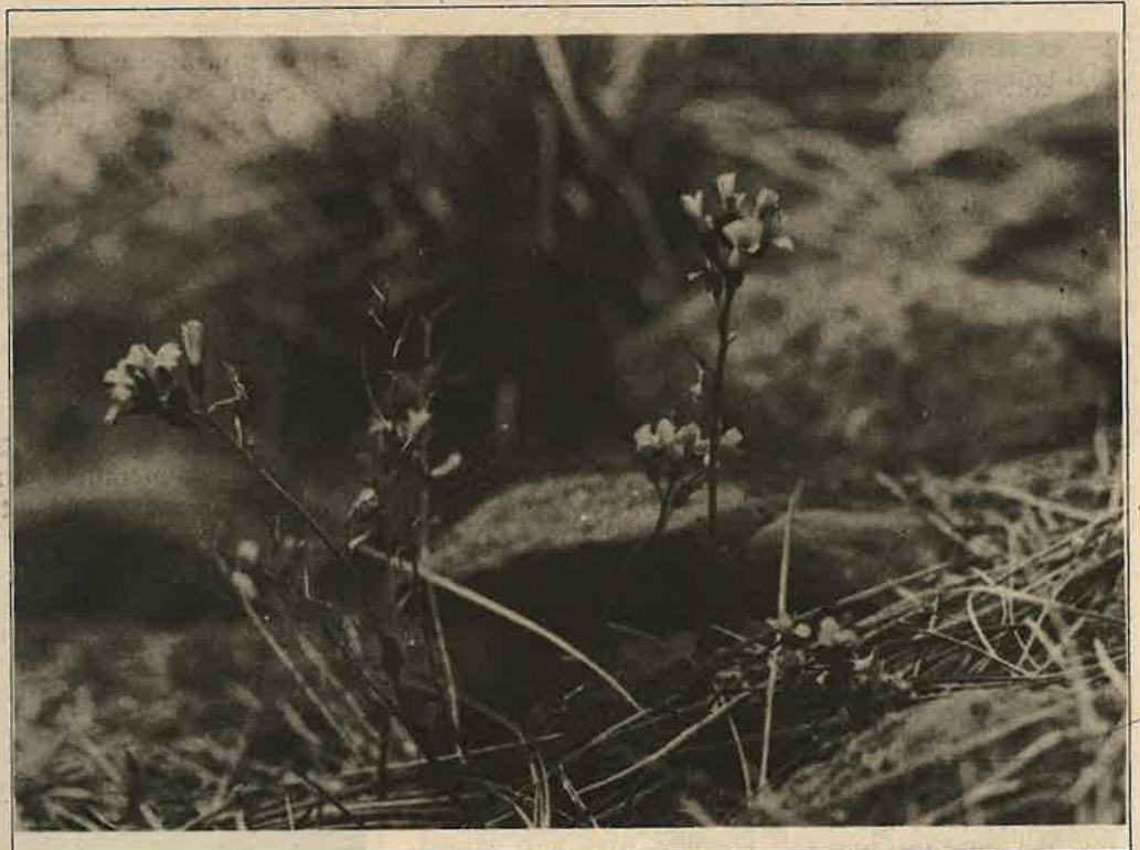
In bloom: the endangered McDonald's rock-cress, Arabis macdonaldiana , which grows only in Red Mountain's unique soils.

A self-taught naturalist, The man who walks in the woods is known to his friends as "Woods" and to his detractors as "The."