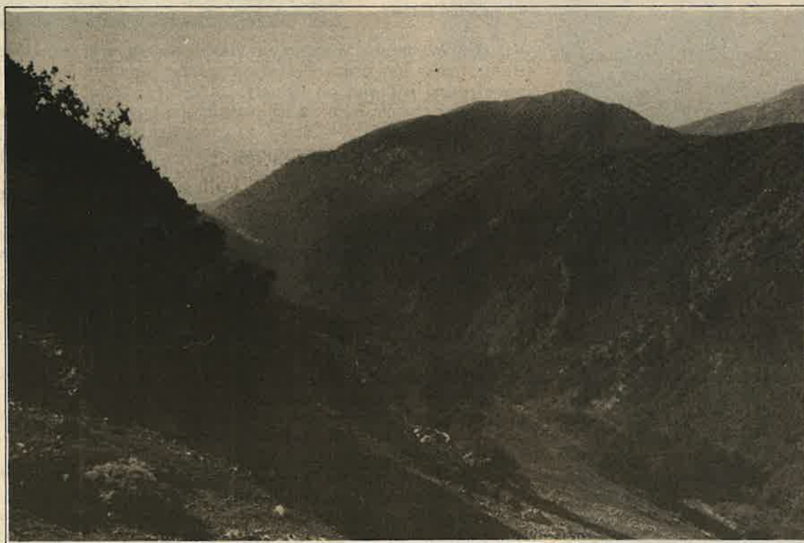
The trail to King Peak in the King Range Wilderness Study Area.

A steering committee will design a process to continue the dialogue begun at the Sierra Summit.