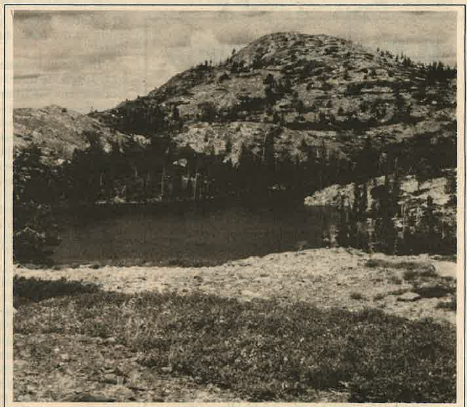
Penner Lake, one of the 125 lakes and ponds in the Grouse Lakes area.