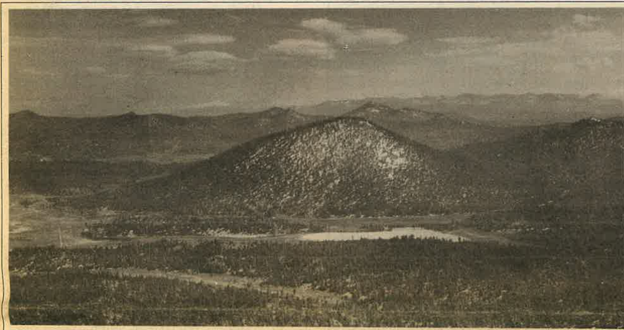
Monache Mountain from Brown Mountain, looking south.