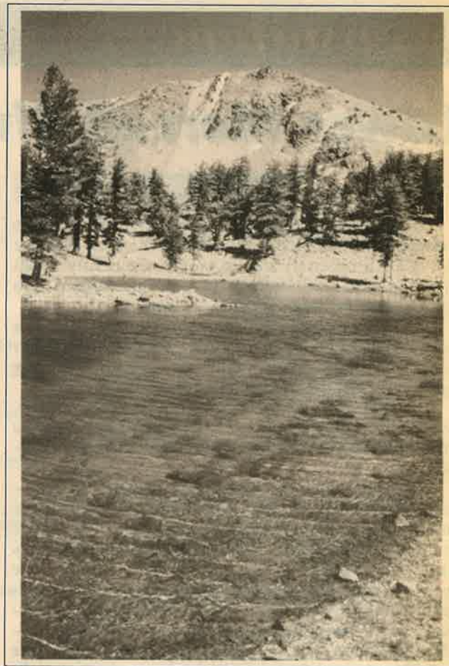
Mt. Eddy from Deadfall Lakes, proposed Mt. Eddy wilderness.