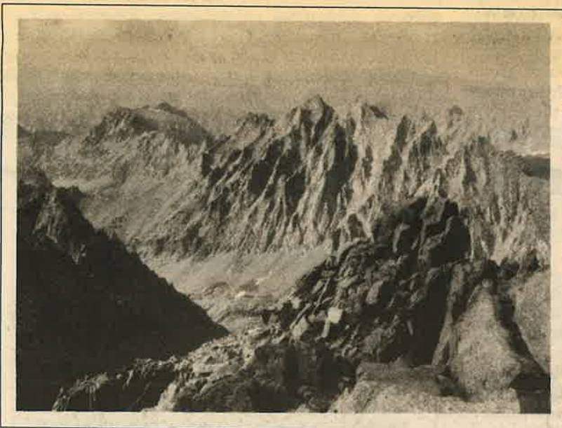
View from Mt. Ericsson south toward the Kern headwaters; Sequoia-Kings Canyon National Park Wilderness.

Using bold strokes, in their book titled The Big Outside , Dave Foreman and Howie Wolke (of Earth First! fame) map out 975,213 acres of national forest, national park, Bureau of Land Management, and private land roadless areas they