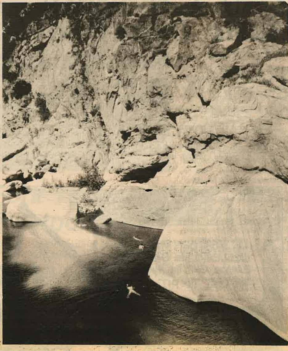
The Condor Range and Rivers Act would permanently protect Sespe Creek and Condor Sanctuary by designating the area as wilderness and adding Sespe Creek to the National Wild and Scenic Rivers System.

(Excerpted from the May 1989 Sierra Club Bonanza .)