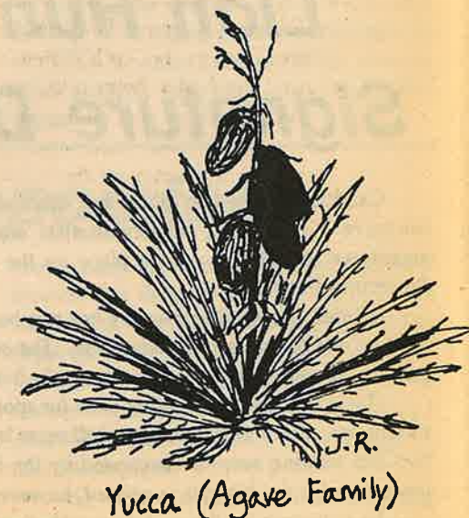
Yucca (Agave Family)

(A more in-depth article on the proposed Castle Mountain gold mine was printed in the April 1989 Record.)