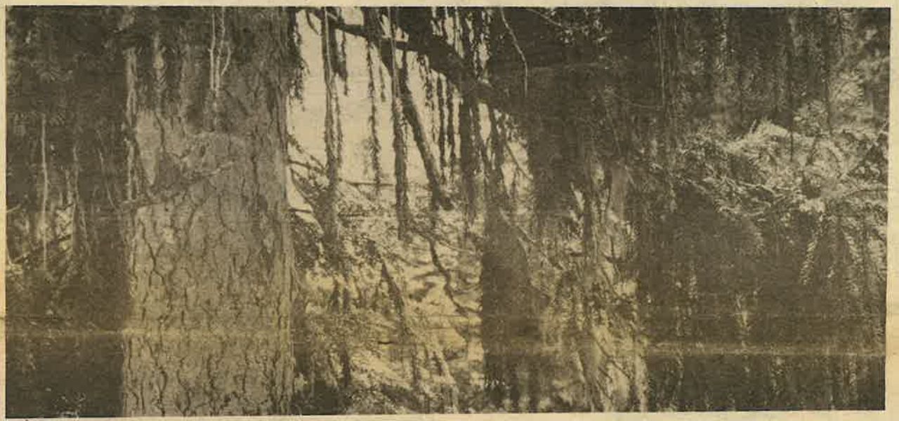
Brewer, or weeping spruce, can be found in northwest California mountain ranges.

More than 40 million board feet of timber has already been logged in this area under contracts issued prior to the settlement. The Forest Service's preferred alternative in the DEIS would allow the sale of another 50 million board feet of timber and the construction of 15 more miles of roads. Approximately 12,000 acres of the Johnson Roadless Area is included in the salvage plan. Many of the cultural, wildlife, fisheries, and outdoor recreation values that are threatened by massive defores-