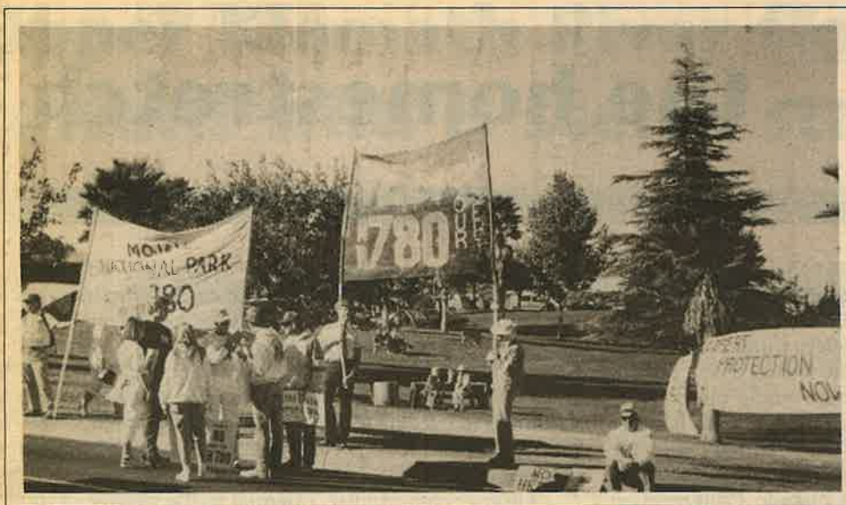
Some 1,000 supporters were at the Barstow hearing.