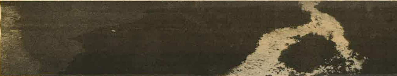
Hells Corner Bend rapid (Class V) on the upper Klamath River.