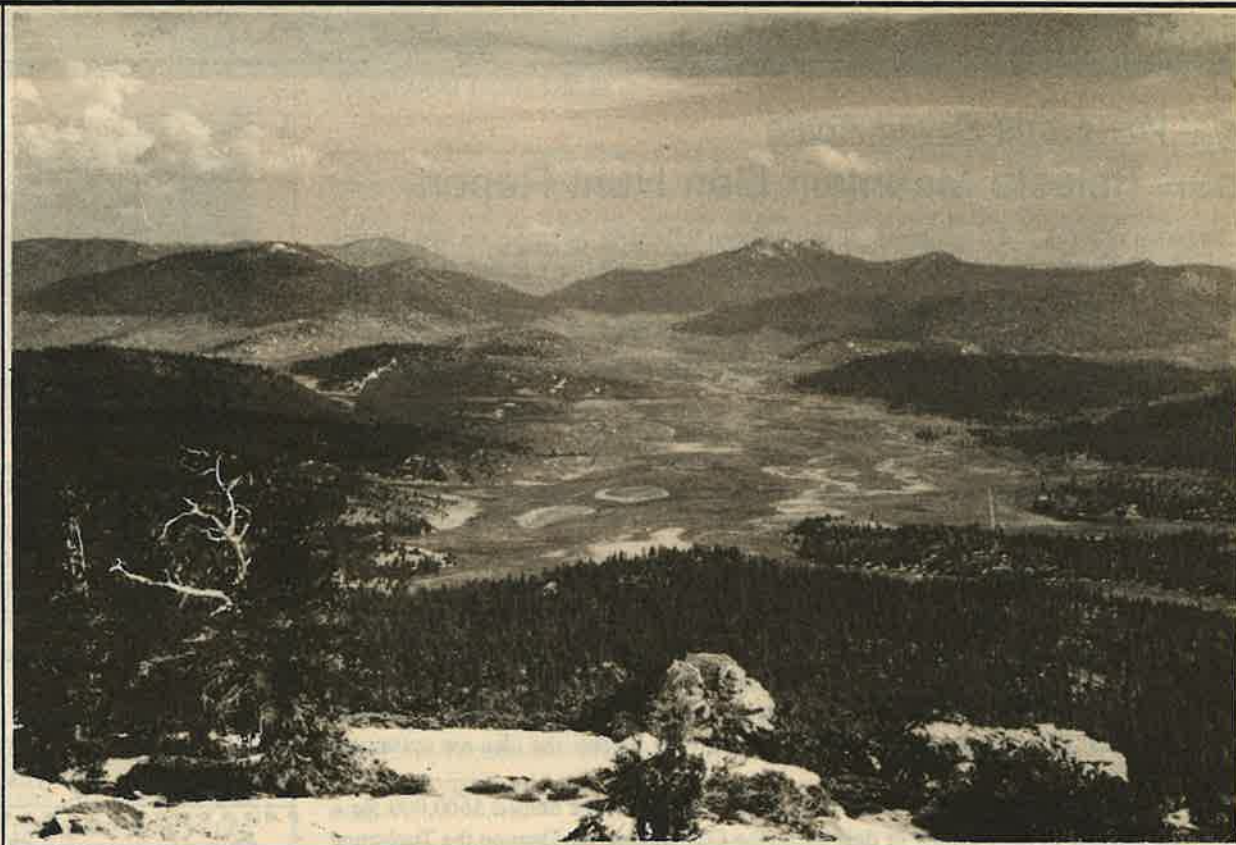
Monache Meadows, southeast of the Golden Trout Wilderness, has become a favorite place for Off-Road Vehicles. View from Brown Mountain looking south.

The bill awaits a vote of the full Senate, which had not been scheduled as of the WR press date. "We're optimistic that it will pass the 100th Congress," said Ron Stork of Friends of the River.