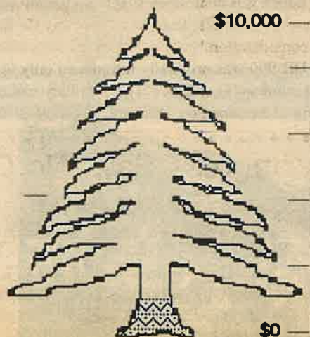
Matching Funds 7/1/88

And if you aren't a member, fill in the membership form on page 8 and join today!