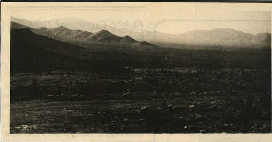
Alluvial fans from the northeast flank of Clark Mountain, in the East Mojave Scenic Area.