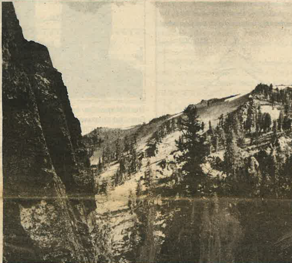
Yolla Bolly-Middle Eel Wilderness, Mendocino National Forest.