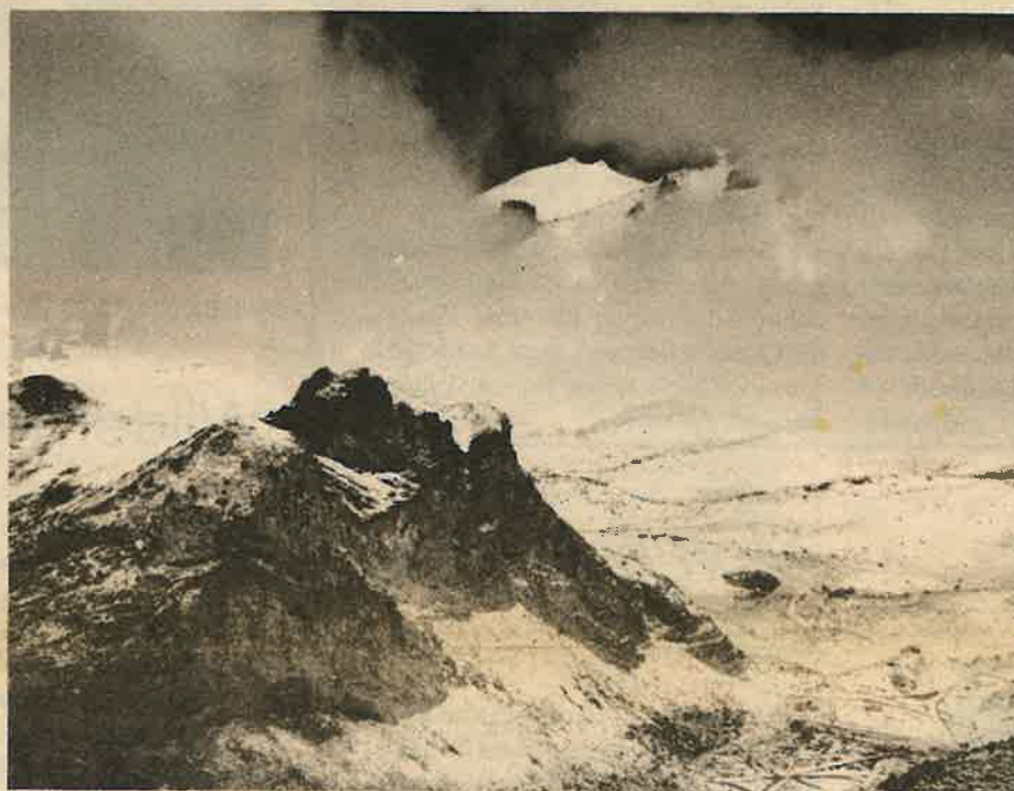
Green Butte, the glacially-eroded volcano in the left foreground, is the proposed site of a chairlift that would ascend the left-hand ridge. Part of Green Butte would be graded to "improve" ski terrain. Twin-bumped summit of Shastina rises behind Casaval Ridge in the background.