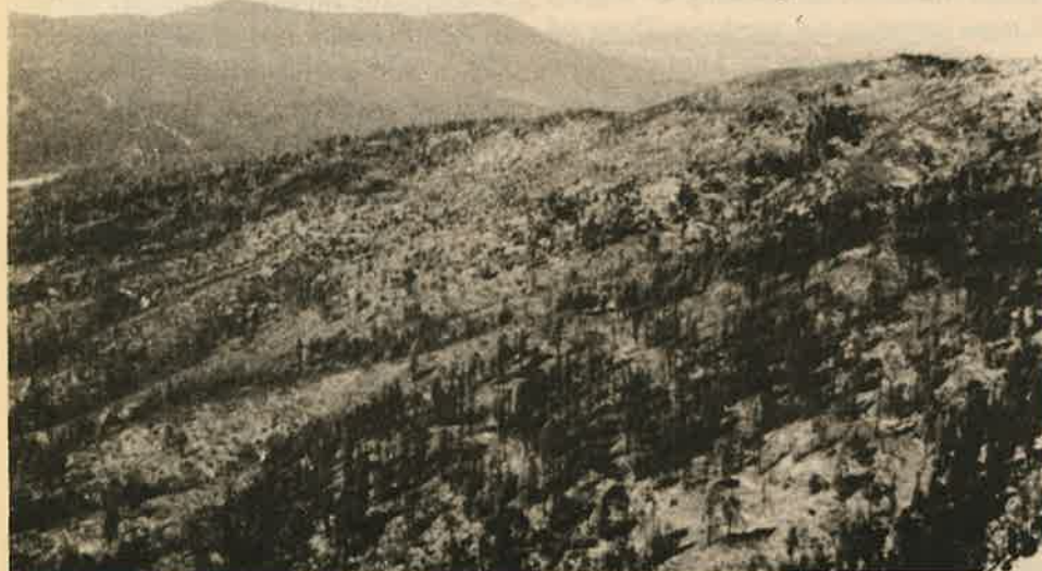
Burned trees in the Elk Creek roadless area in the Mendocino National Forest, looking west from Boardman Ridge. San Hedrin Mountain is in the background and Windy Point at the right foreground.